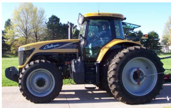
CHALLENGER MT645B Diesel