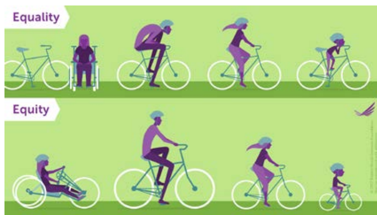
An example of equity in contrast to equality. One size does not fit all. Equity recognizes the different contexts (from societal to personal) in which people live, and allocates resources accordingly (i.e.: the different styles and sizes of bicycles).

Clearly, there are associations that can be made between neighborhood, poverty, minority status and health care. These are big opportunity gaps in Lincoln. The good news is that Lincoln, likewise, has many strengths and assets. There are a lot of interconnected people who are ready and willing to take a hard look at these oppor-