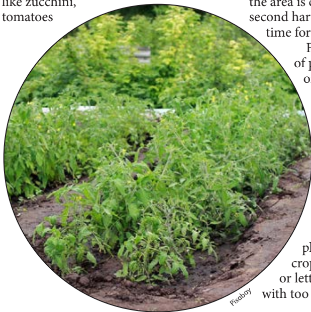
Wide-row planting of tomatoes makes more efficient use of garden space, than single hill plantings.

Mulch around newly planted trees and shrubs. This practice reduces weeds, controls fluctuations in soil temperature, retains moisture, prevents damage from lawn mowers and looks attractive.