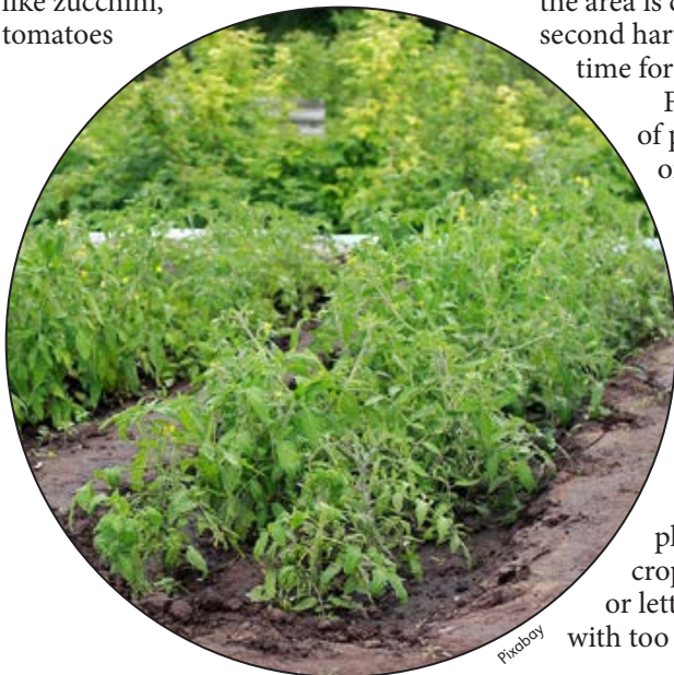
Wide-row planting of tomatoes makes more efficient use of garden space, than single hill plantings.

One of the advantages of a square-foot garden is it's easy to maintain. Since the amount of space is limited, the time needed to maintain the garden is small, too. But you can still grow large plants, like zucchini, tomatoes