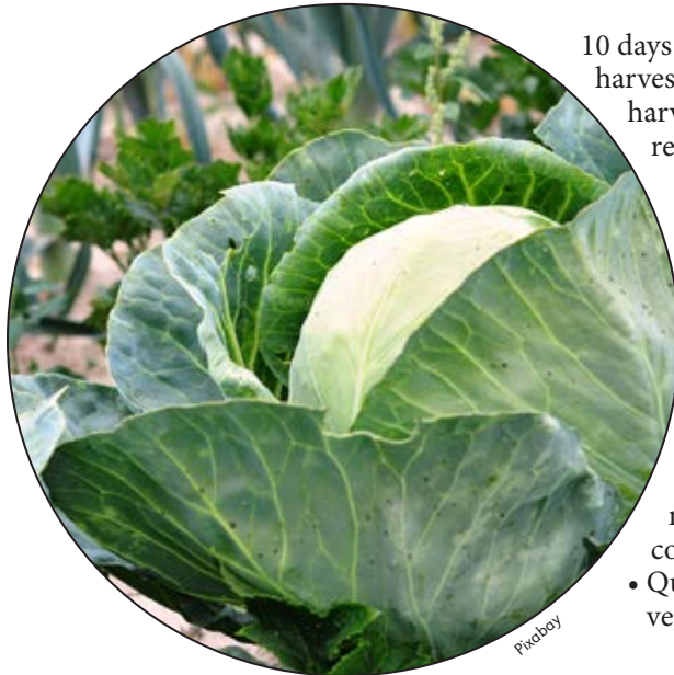
Follow an early-season planting of cabbage by heat-loving crops, such as Swiss chard, summer squash or beans.

or melons, in a square-foot garden. Use vertical structures to save ground space and make harvesting easier.