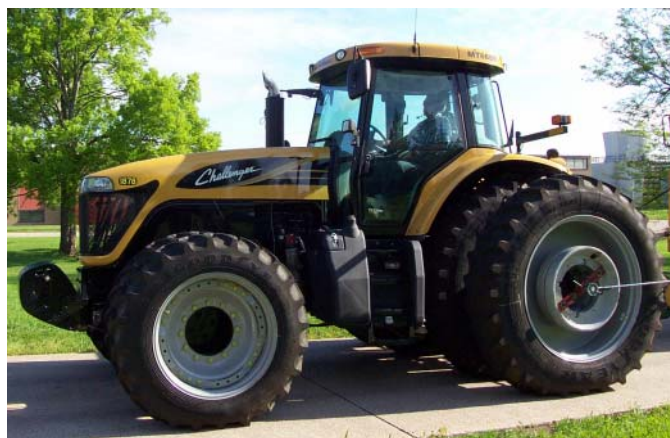
Challenger MT 665B Diesel