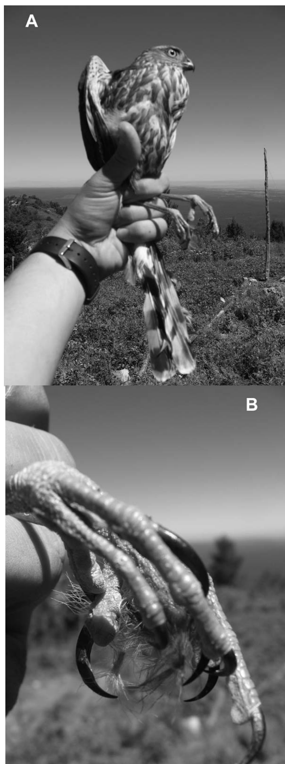
FIGURE 1. (A) A hatch-year Sharp-shinned Hawk captured at Capilla Peak in the Manzano Mountains, New Mexico, with distended crop, indicating recent prey capture and consumption. (B) Close-up of feet of the same bird, showing feathers of prey stuck to toes and talons.

Other researchers sampled potential avian prey in the area at two sites, one near the raptor-banding site at Capilla Peak (DeLong et al. 2005) and the other 35 km north of Capilla Peak in the foothills of the Manzanita Mountains near Coyote Springs. The mist-netting site at Capilla Peak was ~1 km from the primary raptor-banding site along the same ridge complex used by migrating raptors. Migrating raptors frequently passed through the netting area, hunted in the vicinity, and were occasionally captured in the mist nets. The Coyote Springs mist-netting site was in the same mountain range as Capilla Peak, with raptors known to pass through the area before arriving at Capilla Peak. Thus prey sampled