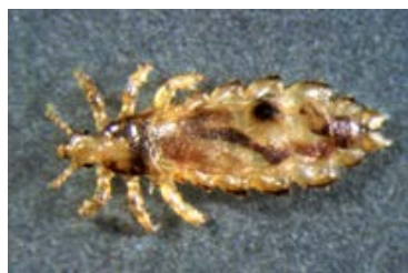
Adult louse (highly magnified)