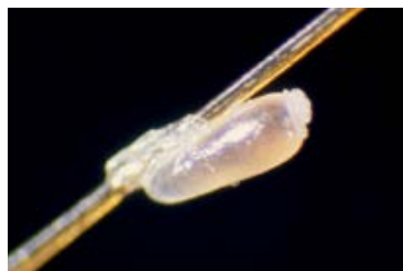
Nit (egg) on a strand of hair (highly magnified)

label. Properly following directions not only keeps the user safe, but it also lowers the risk of developing "super" lice or lice that are resistant to conventional insecticides and difficult to kill.