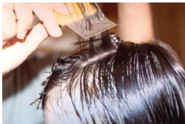
Use a nit comb on wet hair.

One should always follow the directions and safety guidelines on the product