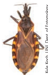
Adult kissing bug (magnified)