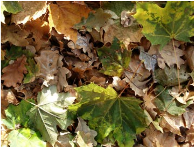
Put landscape waste, such as tree leaves and grass clippings, to good use by creating your own compost.

Fall is a great time for composting and there are many ways it can be done. Putting your landscape plant materials — such as tree leaves, grass clippings, food vegetative waste and garden waste — to good use provides many benefits to the landscape and also lightens the load on our landfill.