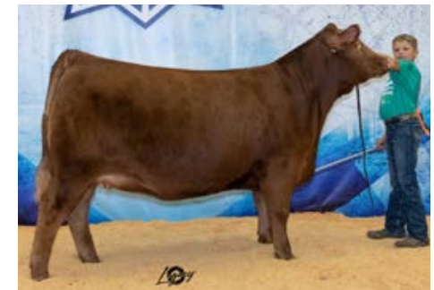
Beef Champion Red Angus Breeding Heifer and Supreme Reserve Champion Breeding Heifer