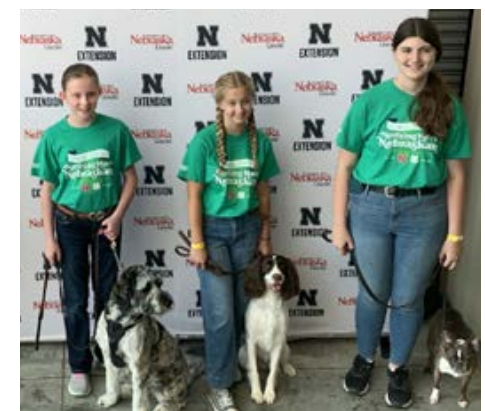
Several members of the 4 on the Floor 4-H dog club earned purple ribbons