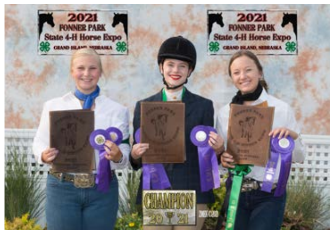
Champion judging team (one youth not pictured)