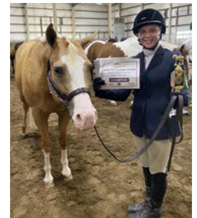
Clockwise from left: Champion 150th Anniversary Exhibit, Top Cookies Exhibit, Alice Doane Memorial Wool Award, Best of 4-H Poultry Show, Elite Showmanship Contest, Rabbit All-Around Showman Award champion and reserve champion, and Horse English Showmanship Junior champion.