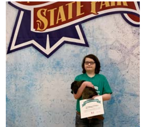
Livestock Achievement Program Member of Excellence in rabbit project area