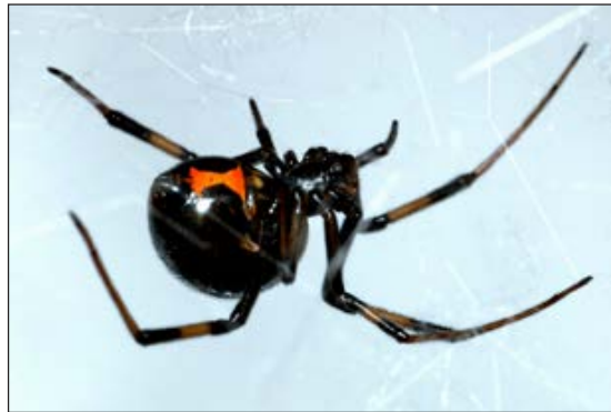
Photo of adult female Black Widow magnified

Black widow venom contains a nerve poison that causes severe pain at the site