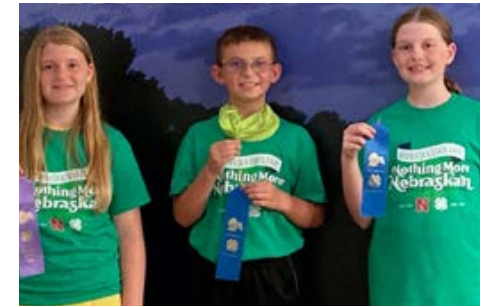
Horticulture Judging Contest Intermediate Team earned 1st place (one youth not pictured)