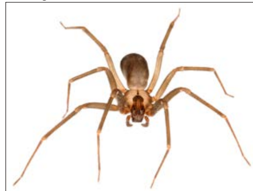
Photo of adult Brown Recluse magnified