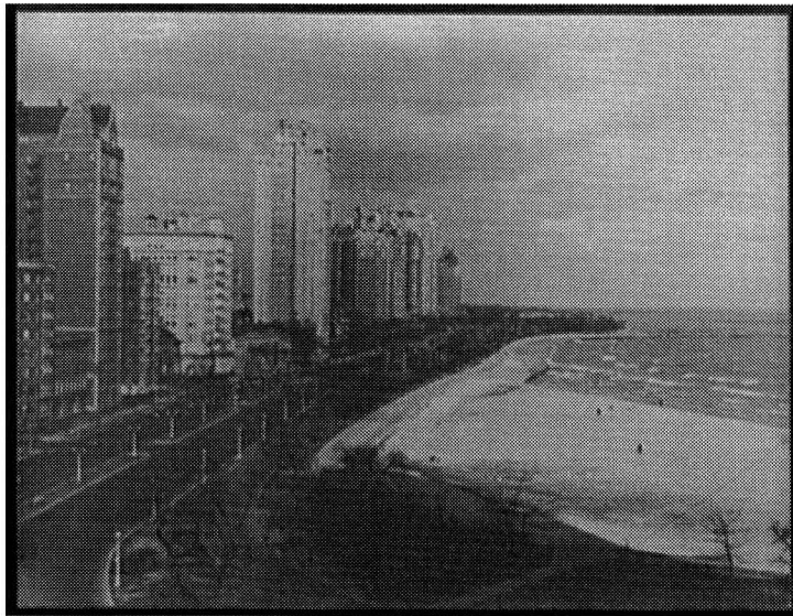
Lake Shore Drive, Chicago, Illinois, November 1934