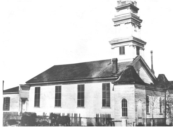
First Congregational Church