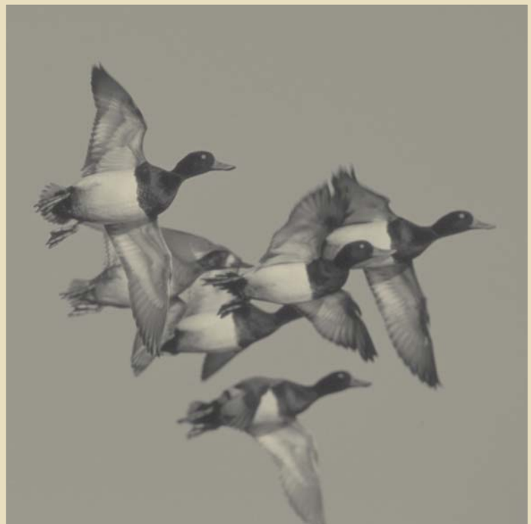
Lesser Scaup

Improving the cost-effectiveness of Plan actions, and strengthening the scientific underpinnings of waterfowl plans, are key to maintaining the Plan's leadership role in conservation.