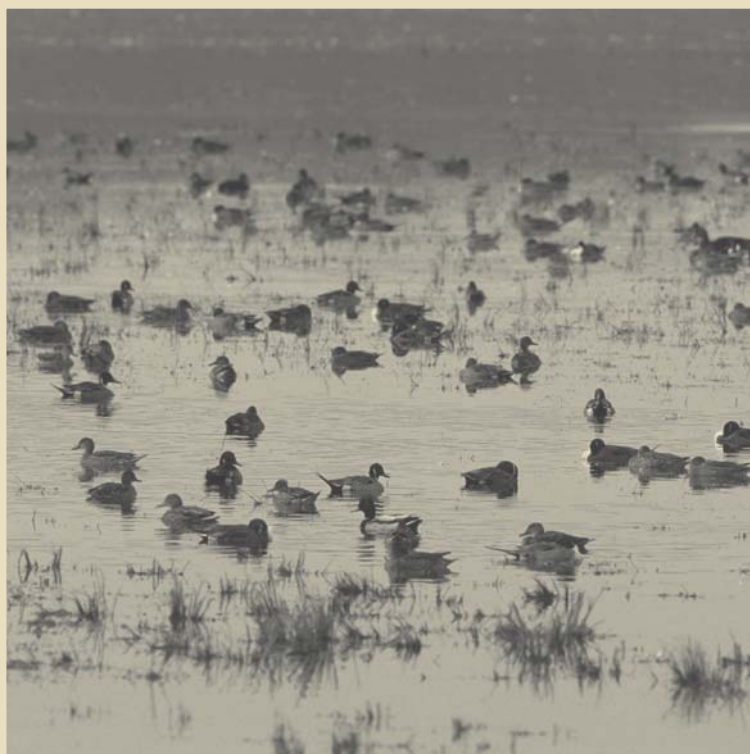
Northern Pintails

Consistent with the 1986 Plan, breeding duck population objectives are derived from average breeding population levels of the 1970s or subsequent species-specific management plans (Table 1). During the 1970s wetland conditions in the prairie-parkland region vital to breeding ducks ranged from fair to good. Duck populations during this decade were generally thought to meet the demands of both consumptive and non-consumptive users. Of the 14 species, species groups, or races of ducks for which goals have been established, 11 presently have stable or increasing long-term trends in abundance. Population objectives have not been established for other ducks because of inadequate monitoring programs or a lack of consensus on desired population levels.