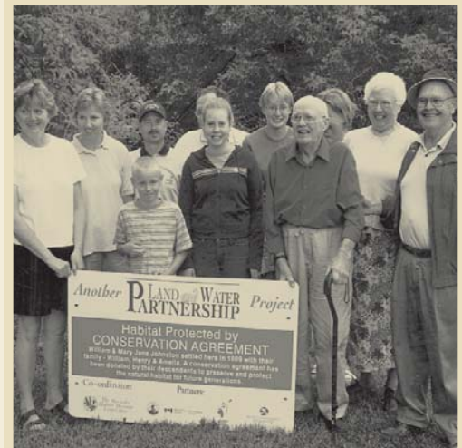
Manitoba Easement Dedication/ Manitoba Habitat Heritage Corporation

The results of this comprehensive assessment will help the Plan Committee and its partners set the stage for the 2009 Update, helping to clarify future priority needs. The results should also provide powerful incentive for financial supporters of the Plan to continue their aid.