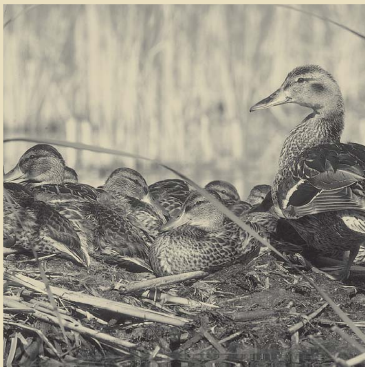
Mallards