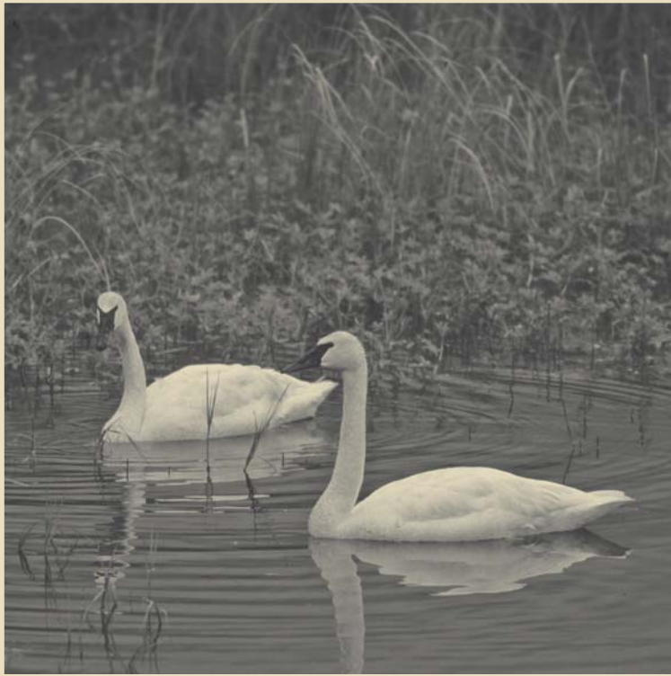
Trumpeter Swans/Ducks Unlimited Canada

The composition of the 2004 North American Waterfowl Management Plan began in June 2001. Since then, many individuals and organizations in Canada, the United States, and Mexico have contributed their ideas, time, and support to this effort. The Plan Committee gratefully acknowledges all who have participated in the process, especially those individuals listed below.