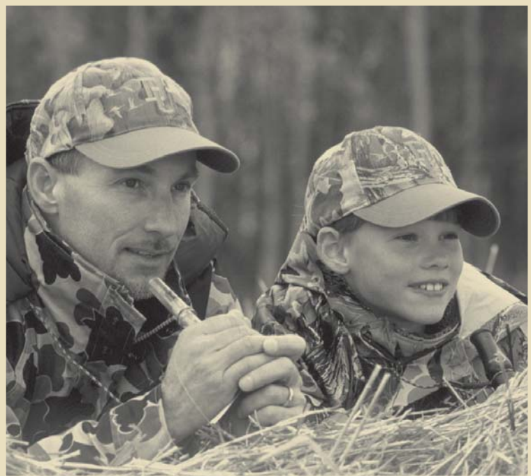
Duck Calling/Ducks Unlimited Canada

The Plan community is better organized for success today than ever before; the challenge now is to fulfill that promise.