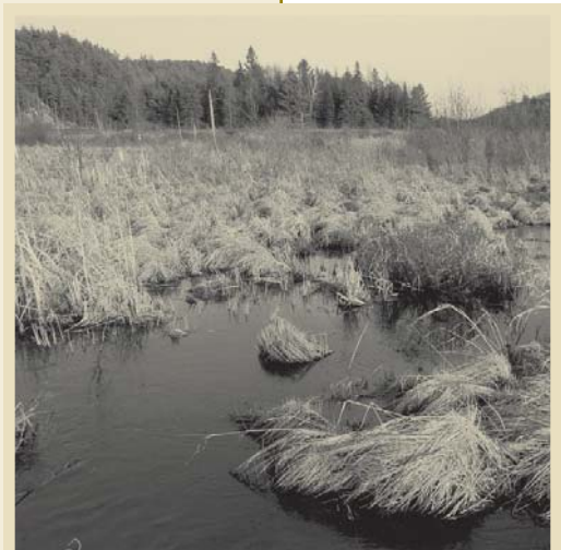
Boreal Fen

The purpose of the Plan is to sustain abundant waterfowl populations by conserving landscapes, through partnerships that are guided by sound science.