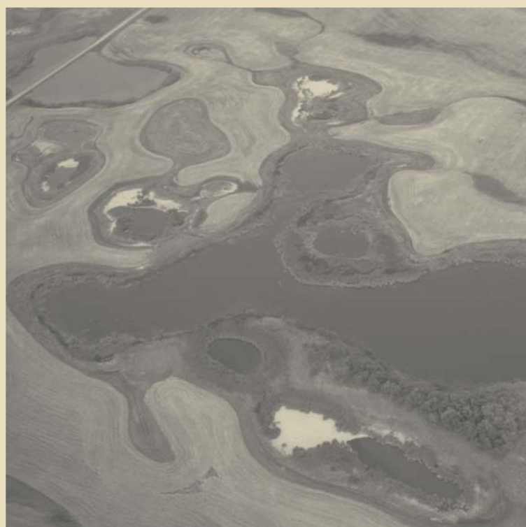
Prairie Pothole Region

critical habitat conservation needs for waterfowl. As the biological foundation for waterfowl conservation has grown, and as Plan horizons have expanded to embrace the full spectrum of North American waterfowl, additional priority areas in all three countries have been identified as critical to the continued maintenance of ducks, geese, and swans throughout their annual cycles (Figure 1). While habitat conservation and monitoring are important in every area of the continent, these areas require special attention and resources.