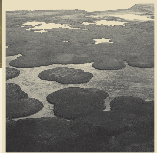
Intertidal emergent vegetation and aquatic bed located along Mexico's Sinaloa coast

These objectives can be achieved only through an understanding of the habitat conditions necessary to sustain target population levels. The Plan's biological foundation, therefore, comprises waterfowl population objectives, habitat objectives, and crucially, an understanding of the ecological links between them. These links include factors that affect the distribution and abundance of waterfowl, and especially the relationships between landscape changes (e.g., water abundance, land use, habitat quality, and Plan conservation actions) and waterfowl birth rates, death rates, and population growth. Understanding the ecological factors affecting waterfowl populations directs the development and implementation of conservation actions. Thus, the biological knowledge base must truly be the foundation for the Plan's future success and must be strengthened.