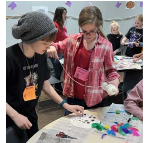
Lock-In participants had fun making carnival masks, a cup & ball game, and a carousel during the crafts session.

"This year the 4th and 5th grade Lock-in was a blast for both teens and kids. The Lock-in is an annual event held by members of the teen council who strive to create a fun, energetic environment for kids. We started the night in a big group playing games and getting to know each other. Then, we split into our groups and visited the games, crafts and foods committees, all led by teens. At the end of the night, we all joined back together and the kids watched movies. This is an amazing opportunity for teens to gain experience in leadership. Once