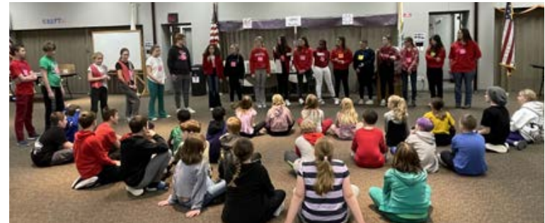
4-H Teen Council members introduced themselves to kick-off the carnival extravaganza-themed 4th and 5th grade Lock-In.