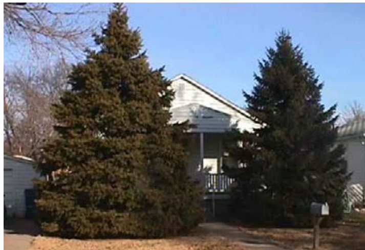
Spruce trees planted too close to front of house are now blocking the entrance and views.

Do some research before putting a plant in the ground and have a