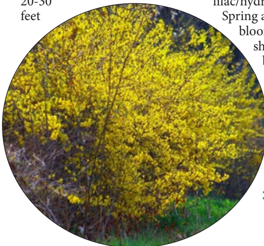
Forsythia is an early spring blooming shrub, which is often pruned at the wrong time, removing many of its flower buds.

good understanding of how tall and wide it will get. Pay attention to suggested spacing and follow these recommendations as a minimum. Don't worry about your neighbors teasing you for planting a tiny "stick" 20-30 feet