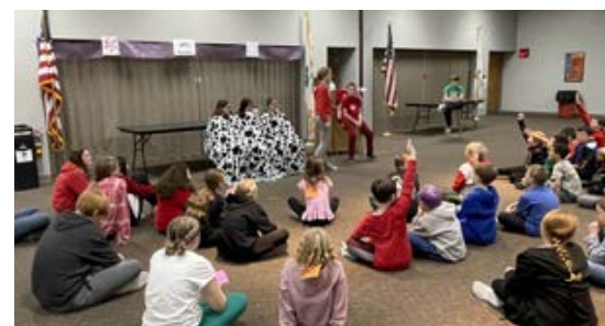
Lock-in participants were excited to meet the "XYZ Monster" and had many questions for it!