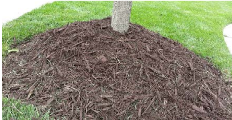
Volcano mulching is very bad for trees.

6. Volcano Mulching. This refers to a cone-shaped mulch mound piled around the base of trees and laying against the tree's bark. Excessively