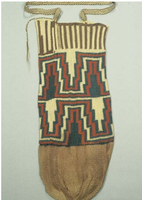
Fig. 11 – Elongated bag (41.5x19 cm) in simple looping with interlocking color change, strap in plain weave, all in camelid fibers. Design is bands of superimposed, multicolored ascending and descending steps, and with mirror image.