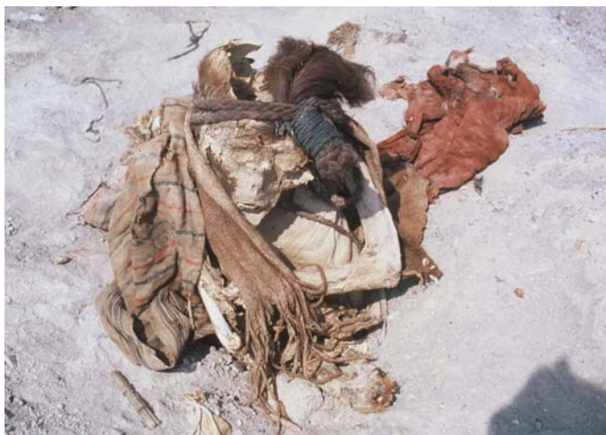
Fig. 7 – Mummy (La Chimba, Sihuas Valley, 19 April, 1997) with unusual hairdo and two Sigwas 1 textiles. One is a striped mantel with the Sigwas Striped Band edging and the other a band in sprang with fringe, both in camelid fibers.