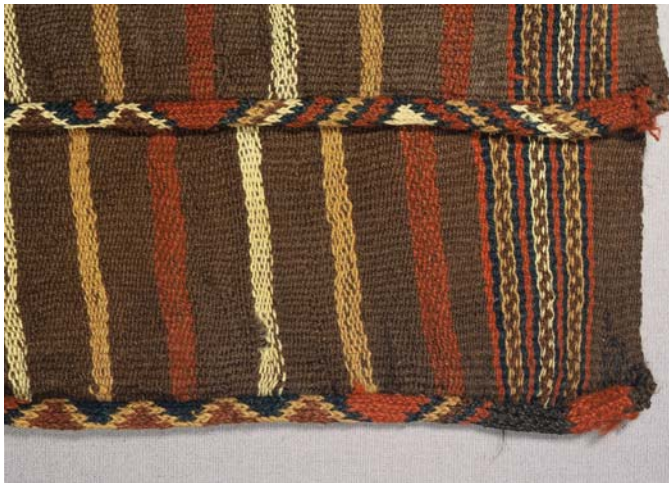
Fig. 5 – Textile (59x95 cm) with warp faced striping, folded over showing two type of edgings, one in tubular cross-looping, the other in Sigwas Striped Band. Warp and weft in camelid fibers.