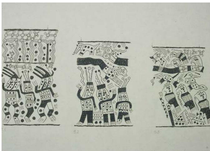
Fig. 9 – Drawing of figures engraved on upper three sections (9.4, 8.5, 8.2 cm) of a cane.