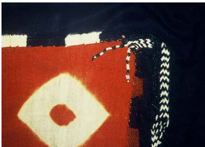
Fig. 8 – Textile, tie-tyed, with Sigwas Checkered Band edging in three colors and typical reinforcement for ties, camelid fibers.