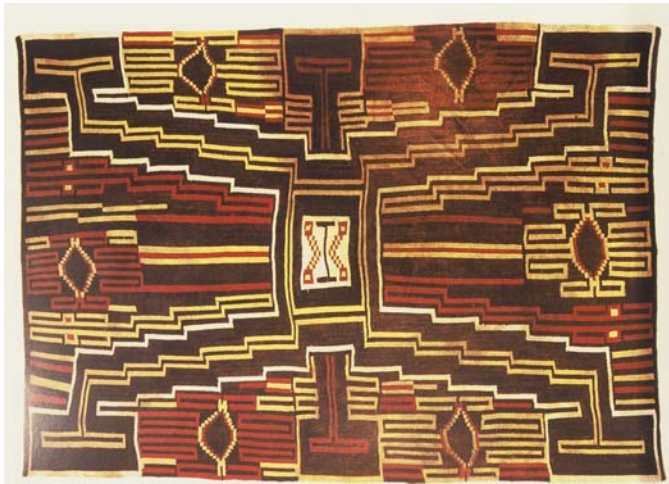
Fig. 4 – Textile (142x127 cm) in double interlocking warp and weft, camelid fibers, with Sigwas Central Head Theme, type C,