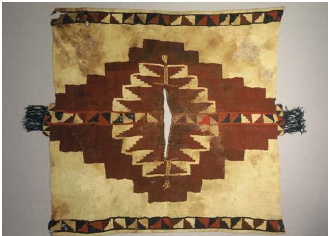
Fig. 2 – Opened tunic (103x99 cm) in double interlocking warp and weft. Fringed epaulets in interlocking tapestry. Neck-opening edged in tubular cross-looping and with a reinforcement with fringed tab. All in camelid fibers, except epaulet's warp is in cotton.