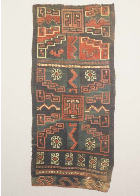
Fig. 10 – Band (55x26 cm, fragment) in interlocking tapestry with weft in camelid fibers and warp in cotton. Narrow band at the hem in cross-looping over a cotton foundation. Represented is a head with radiating appendages and secondary figures