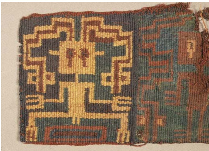
Fig. 6 – Band (12.5x22 cm, fragment) in interlocking tapestry using one weft and two warp yarns, both in camelid fibers, with representation of a crouching woman.