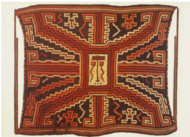
Fig. 3 – Textile (1.0x0.89 cm) in double interlocking warp and weft having ties in oblique interlacing at each corner, all in camelid fibers, with Sigwas Central Deity Theme, type B