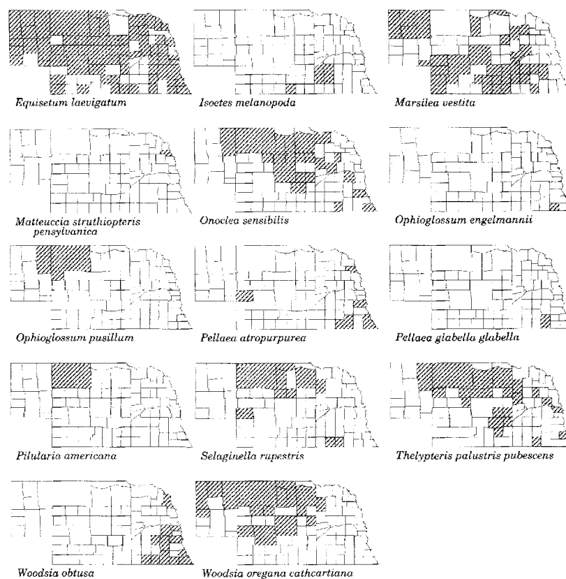
FIG. 2. (cont.)