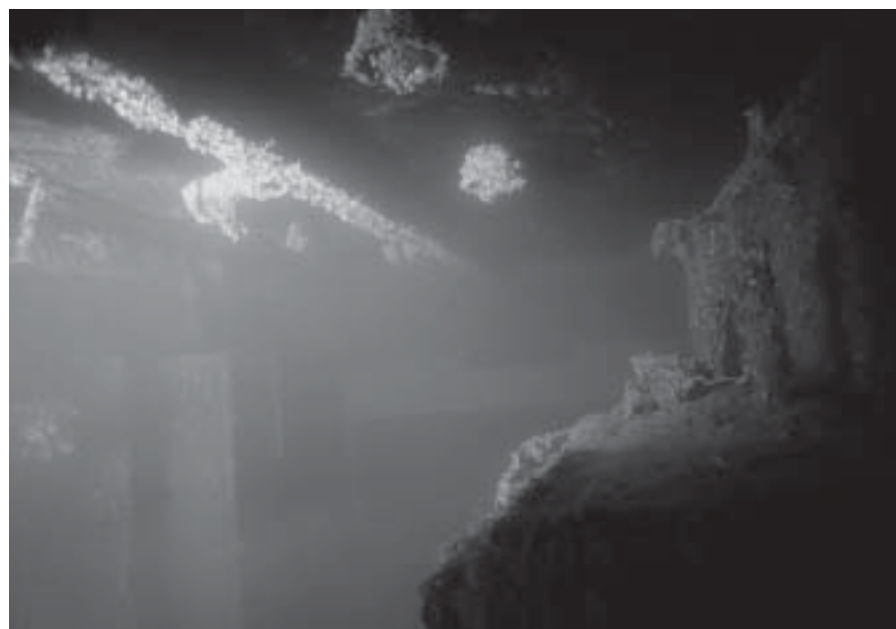
Illumination inside a Junior Officer's Stateroom reveals oil pooling between deck beams of the ceiling overhead. A white microbial community is visible growing on the oil surface at the left of the photograph.