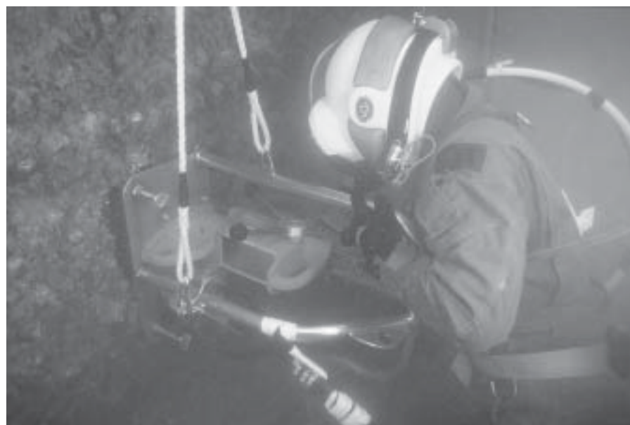
A Navy diver from Mobile Diving and Salvage Unit One collecting a coupon from USS Arizona ’s hull.