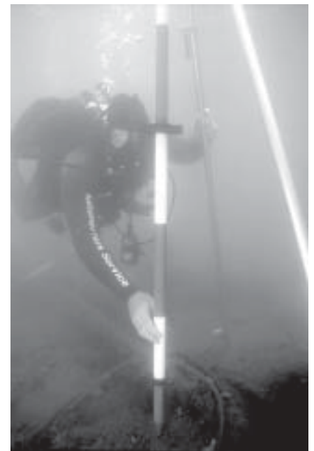
NPS archaeologist Larry Murphy setting up an underwater tripod on USS Arizona used to collect high-resolution GPS positions.