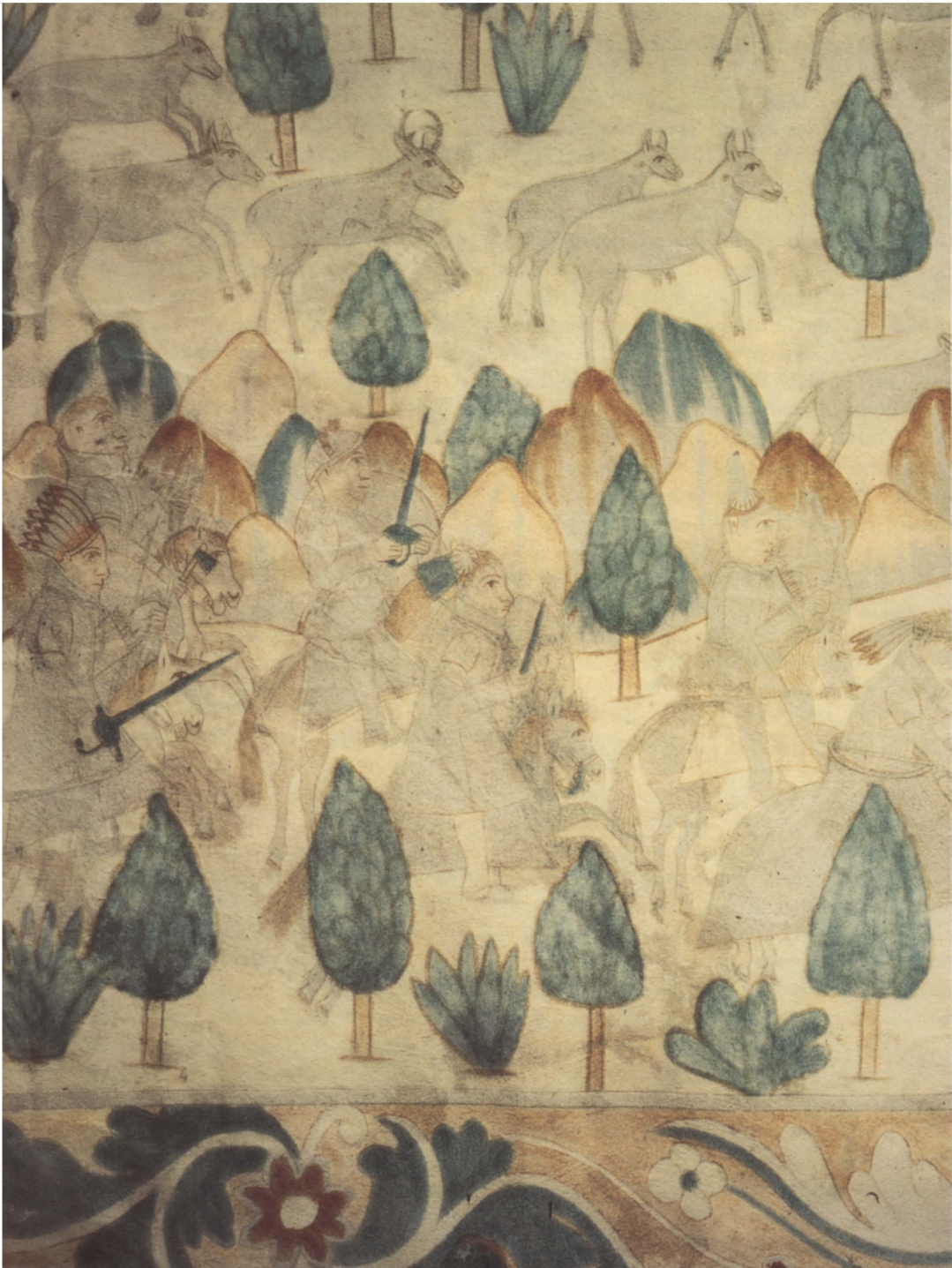
FIG. 2. Detail of the attacking cavalry in Segesser I. With the exception of some of the headdresses, all the clothing, armor, and weapons are Spanish, but the pronghorns indicate that the site may have been the Great Plains. Segesser File, Palace of the Governors, Santa Fe.