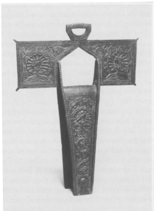
FIG. 5. Cruciform wrought iron stirrup as depicted in Segesser II; see the right hand side of figs. 3 and 4. MNM no. 14733, Place of the Governors Collections 4910/45, Santa Fe.

staff, exhibited at the Palace, and officially appraised. It was hoped that the presence of the intriguing works would generate enough local support to raise funds to purchase them for the Palace of the Governors. Dr. Segesser agreed to the proposed plan.