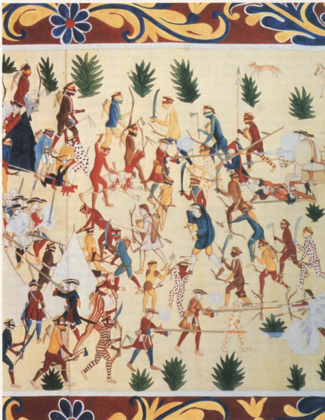
FIG. 4. The same detail in the brightly colored replica of Segesser II prepared by Curt Peacock for the Nebraska State Historical Society. Peacock replicated the hues of the natural dyes on cowhide to recapture what are believed to be the original hues and details of the painting.