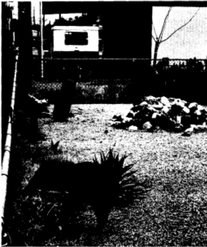
Figure 1.--Javelina ( Tayassu tajacu ) or collared peccary, frequently cause nuisance problems in metropolitan Phoenix and Tucson. These individuals were removed with tranquilizing dart gun.