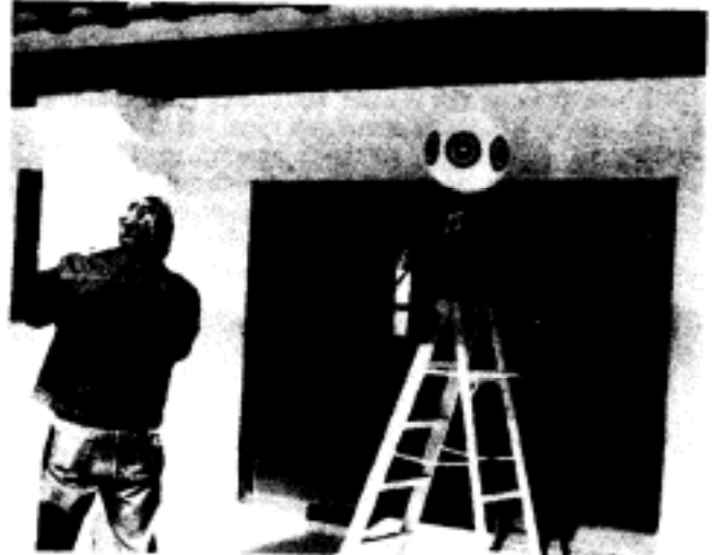
Figure 3.-Wildlife Service Permittees remove wildlife, devise plans, or offer advice on nuisance problems at a cost to the affected citizen.

Response to individual cases helps the immediate nuisance problem a property owner is experiencing, yet AGFD is working to prevent or