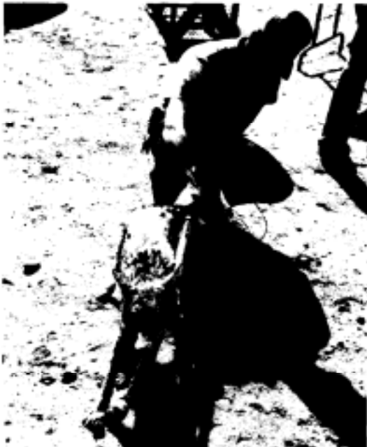
Figure 2.--Coyotes ( Canis latrans ) are occasionally found in towns allowing horse properties or where washes and native vegetation remain.

Two modes of development have been used: 1) removal of native habitat, with evenly spaced residential or commercial communities, and 2) widely-spaced or clustered communities with corridors of native habitat left intact (this mode has become more popular as consumers and developers became more ecologically conscious). These two methods of development have created pockets of untouched or minimally impacted habitat surrounded by developed sites.