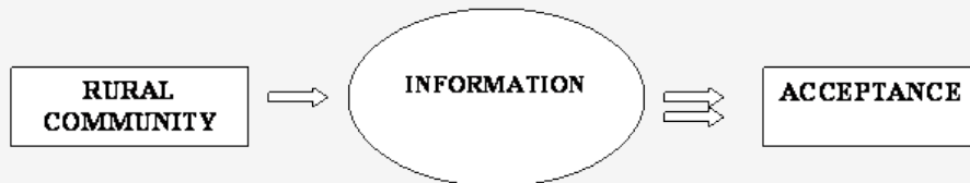
Figure 2. Acceptance of information as change agent

Introducing ICT to rural communities could result in resistance, and introducing the need for information can reverse the effect. Creating a demand for information that serves rural communities will initiate the process of information seeking. Convincing rural communities of the importance of information will result in acceptance of information as a key for development. The ultimate goal is to be “information-haves” rather than “technology-haves.” Rural communities must discover the information that is relevant to their activities. Figure 2 below suggests that creating awareness of the role of information will definitely bring rural communities to accept, seek, and use it.