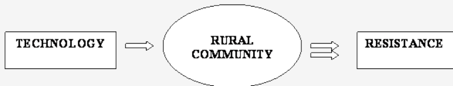
Figure 1. Resistance to Technology as change agent

Access to information in rural communities is affected by a number of barriers, such as infrastructure, low level of literacy, lack of proper information services, technical competencies, and lack of proper information policy and governance directed to rural communities. Despite the potential of ICT, technological barriers are perhaps the most challenging aspect to be addressed. Pushing ICT into rural communities could create resistance, because it requires a new set of skills and competencies. If not properly planned and developed, ICT could be perceived as a threat to rural communities. Pushing ICT to be accepted as an agent of change could lead to resistance to ICT as shown in figure 1 below.