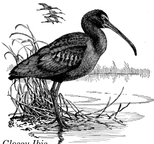
Glossy Ibis

We employ methods to restore quality nesting habitats , such as removing introduced predators from seabird nesting islands, manipulating vegetative structure