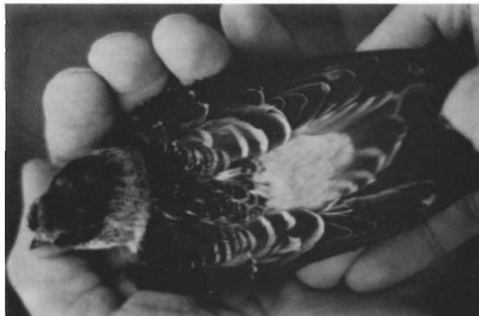
Fig.1. Ventral and dorsal views of juvenile Cave Swallow found in Garden County, Nebraska, May 31, 1991.