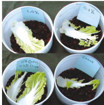
Figure 1 Repulsion of slugs ( Veronicella cubensis (Pfeiffer)) by caffeine-sprayed leaves. Results pictured (clockwise, from top left) are for no-choice treatments using 1.0, 0.1 and 0% caffeine, and for a choice test with 0 (left leaf) and 0.5% caffeine. Caffeine treatment causes slugs to avoid the leafy parts of the cabbage.

To test the effect of caffeine on snails, we treated mature orchid snails ( Zonitoides arboreus (Say); about 3 mm in diameter) topically with caffeine solutions in Petri dishes and examined them under a dissecting microscope to determine their heart rates. One hour after treatment, the heart rates of snails exposed to 0.01% caffeine were raised, whereas those of snails treated with 0.1, 0.5 or 2% caffeine were reduced (Fig. 2a). After 24 h, heart contractions