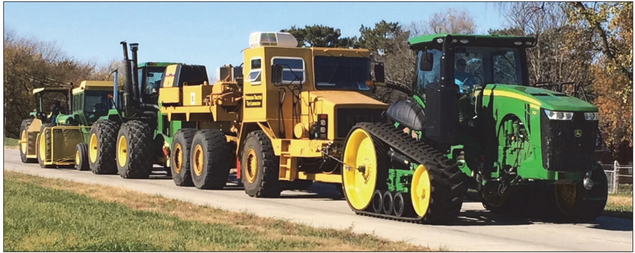
Figure 2. John Deere 8345RT during tests with the NTTL Test Car and three additional load units on the test track at the Nebraska Tractor Test Lab on 4 November 2014.

sumption, and load) for consistency. When the NTTL engineer saw the key data values reach a relatively steady state, data collection began. If any of the key indicators were outside of an acceptable range, additional datasets were collected until the requirements were met. The same test engineer collected data for all of the tractors for consistency.