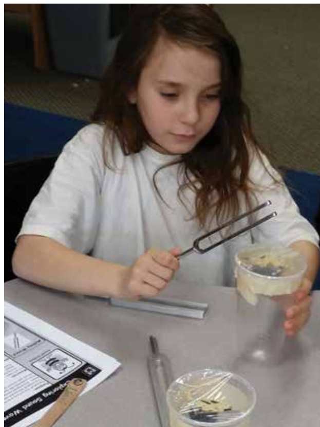
Bringing the tuning fork close to the cup caused movement of rice grains atop plastic wrap.