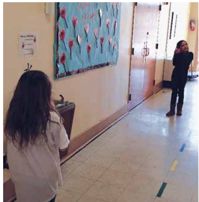
Students try out a plastic-cup phone.

such as enabling audio, clicking on the listener, and setting frequency and amplitude ranges. Once our students