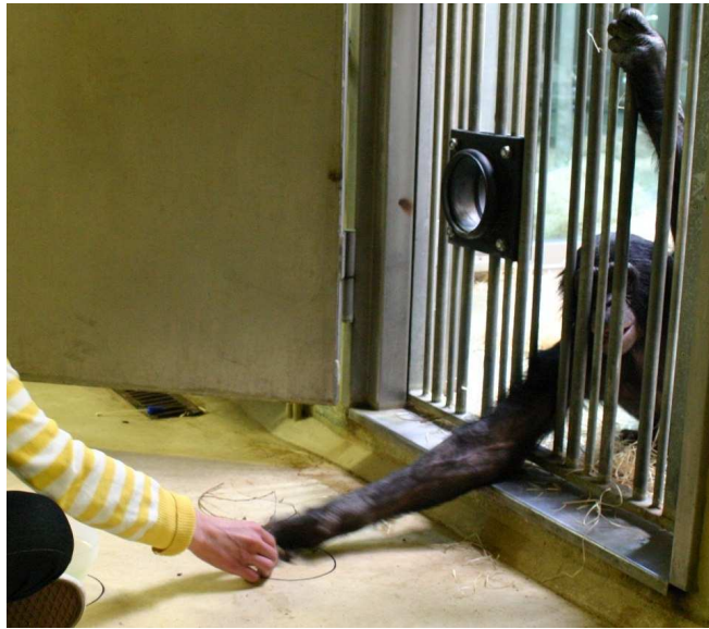
Figure 1. Experimental apparatus. Experimenters placed grapes in a circle within the bonobo's reach. Once the bonobo's hand crossed the circle, the experimenter stopped placing grapes.

the apes both when placing the grapes and during the intertrial intervals.