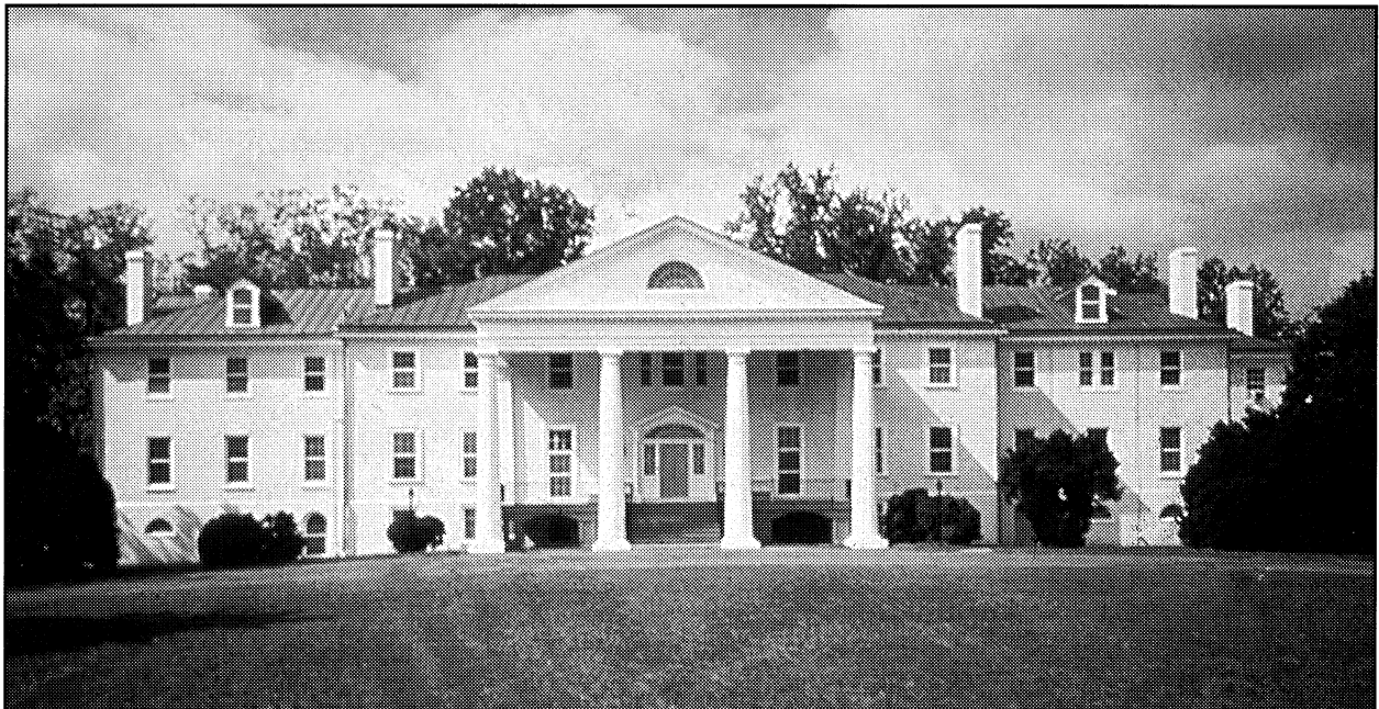
Montpelier, the home of James and Dolley Madison.