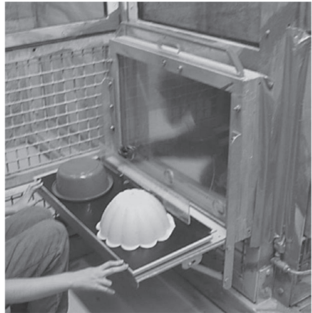
Figure 1. Apparatus. Chimpanzees and bonobos chose between fixed and risky rewards hidden under bowls.

In choices between a fixed and a risky reward option (using choice trials from all sessions), chimpanzees were risk seeking (mean \pm s.e. proportion choosing fixed option, 0.36 \pm 0.04 ), significantly preferring the risky reward ( t(4) = -3.48 , p = 0.025 one sample t -test, all reported comparisons are two-tailed). In contrast, bonobos were risk averse ( 0.72 \pm 0.03 ), preferring the fixed reward to the risky ( t(4)=6.40 , p = 0.003 ). Chimpanzees