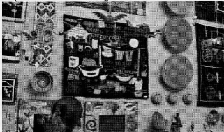
Fig. 8 Arts Africa, July 2002.