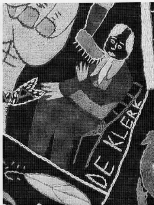
Fig. 5 Detail of Selinah Makwana, Untitled ( Bafana Bafana )

climate in which there has been an imperative towards the fostering of pride in all things South African. And certainly, in a general sense, they convey meanings that would seem to conform with Thabo Mbeki's vision of an 'African Renaissance' that he first articulated in 1996 – one underpinned by a concept of South Africa as leading an economic and cultural regeneration of the continent through the celebration of indigenous traditions in all their diversity. But what is perhaps even more notable – at least in the more explicitly political works – is that they celebrate not only black leaders, such as Nelson Mandela and Thabo Mbeki, but also white leaders such as F.W. de Klerk (Fig. 5). Indeed one cushion cover, which was reproduced in a newspaper article in 1994, represented Mandela's negotiations with the Afrikaner Resistance Leader, Eugene Terreblanche. 10 The kind of imagery used in embroideries such as these tallies with the multiculturalism that has characterised the