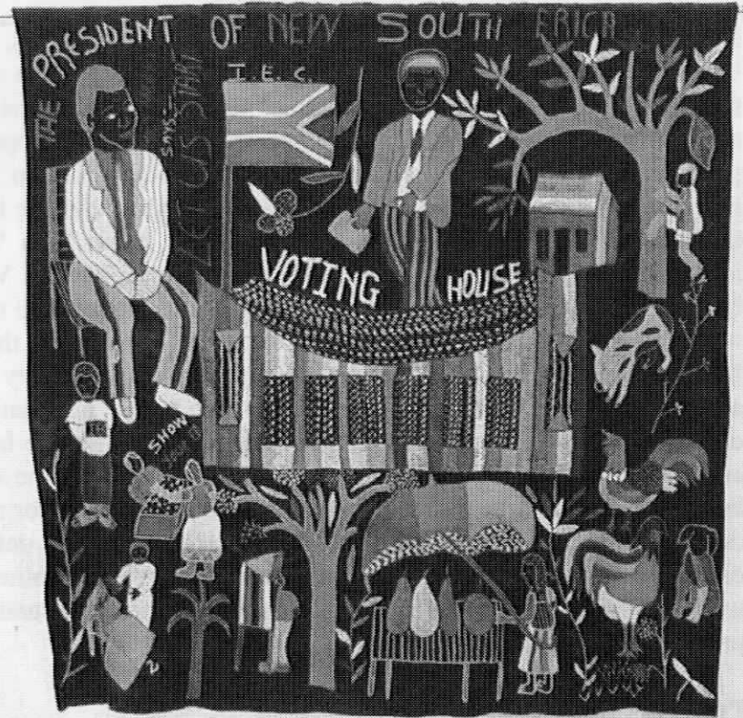
Fig. 2 Rossinah Maepa, Untitled ( The 1999 Election ) (1999) embroidered cloth, 114 x 114 cm, private collection.

While early cushion covers by the group tended to focus on animals or flowers, the 1993-1994 period saw the introduction of subject matter focusing