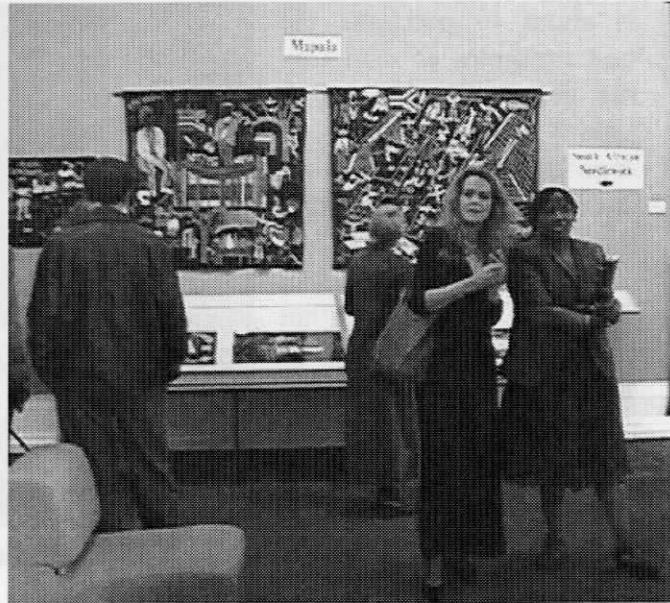
Fig. 6 The opening of "Material Matters" at the King George VI Art Gallery in Port Elizabeth, South Africa, 19 October 2000.

one example. 12 “Material Matters”, an exhibition held at five major galleries in South Africa in 2000 and 2001, is another (Fig. 6). 13 Other exhibitions have looked at Mapula as an example of the creativity of South African women. These include “Women’s Voice”, which was shown in Stuttgart in Germany in 1998, 14 and “Women of Tshwane”, which was shown at the University of Stellenbosch in 2001. 15 Shows such as these have conveyed a message that embroidery, which is so often denigrated to the level of a minor ‘craft’, is in fact no less worthy of validation than works made in media which westerners more readily associate with ‘high art’, such as oil paint. They have undoubtedly also conveyed a message that Mapula works are worthy of inclusion in prestigious public, corporate or private collections, and that they warrant fetching prices that buyers might more normally pay for works in other kinds of media.