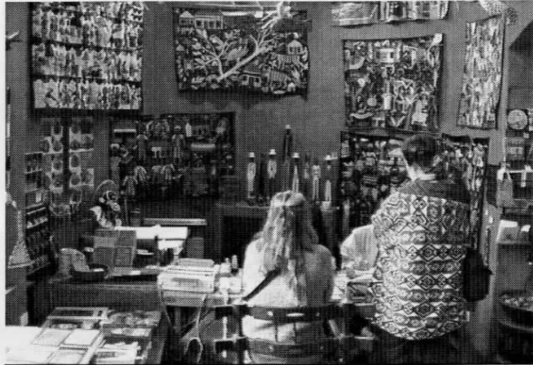
Fig. 7 The Kim Sack Gallery, July 2002.

The act of drawing qualitative distinctions between works is necessarily going to be informed by personal ‘taste’, and Van der Merwe’s sensibilities inevitably have an impact on her decisions. Also it is probably unavoidable that only some makers will get feedback from her that encourages them to produce the kinds of embroideries that she believes best lend themselves to inclusion in more prestigious collections. The project has included over eighty women for the last few years, and it would be unrealistic to expect