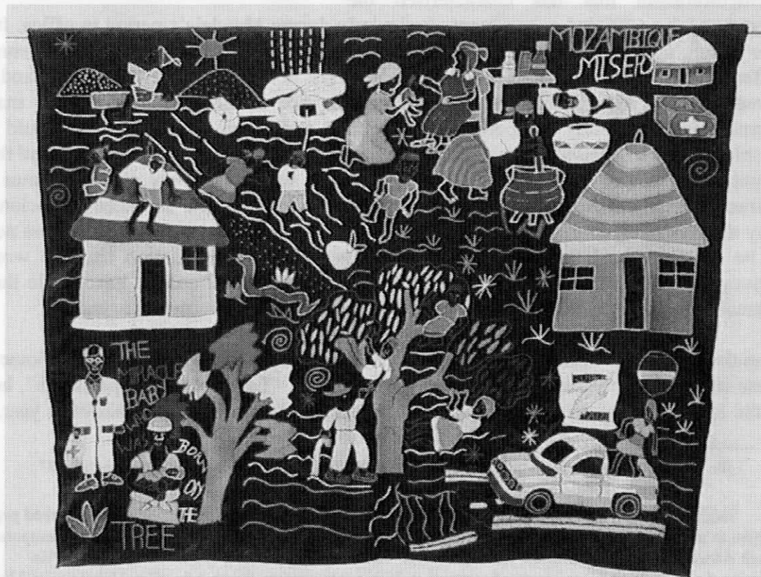
Fig. 4 Unknown artist, Untitled ( Mozambique Misery ) (2000), embroidered cloth, 82 x 110 cm, private collection.