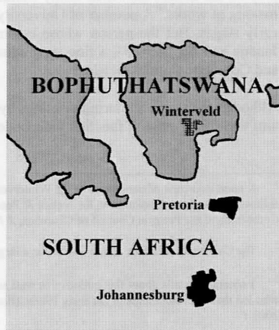
Fig. 1 The Winterveld: December 1977 - May 1994