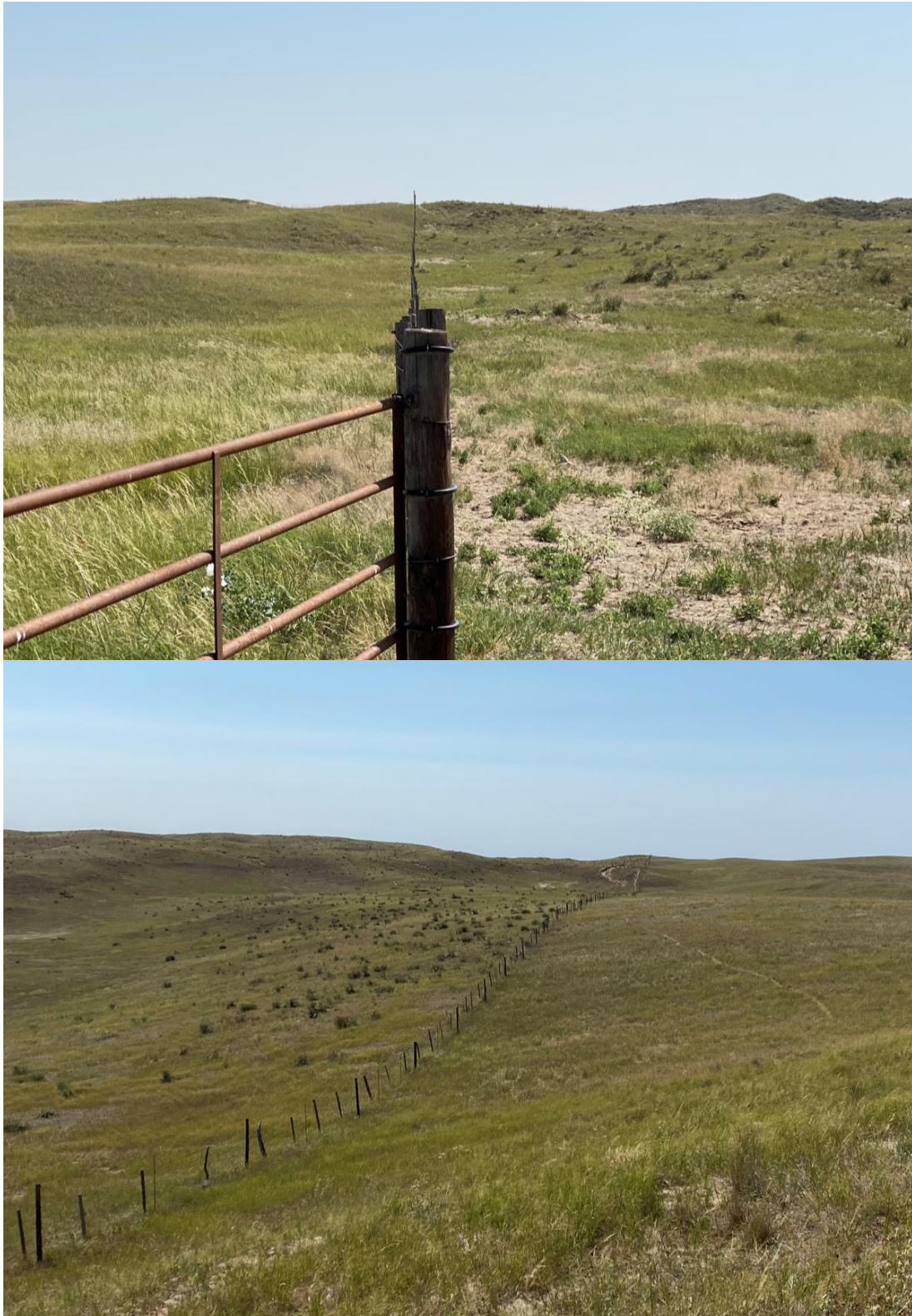
Figure 2. Fence line contrasts in the abundance of Soapweed Yucca ( Yucca glauca ) between pastures grazed by American Bison ( Bos bison ) and Domestic Cattle ( Bos taurus ) in the Sandhill Region of Nebraska. Top photograph, bison ranch on left side and cattle ranch on right side, Cherry County, Nebraska. Bottom photograph, cattle ranch on left side and bison ranch on right side, Garden County, Nebraska.