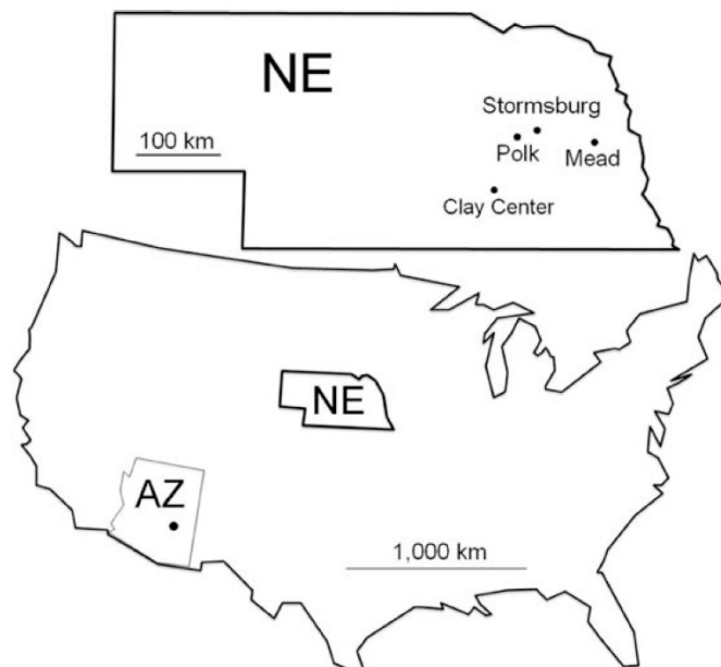
Figure 1. Sampling sites of western corn rootworm beetles in Nebraska and Arizona.

Adult western corn rootworms were collected from corn plants at four sites in southeastern Nebraska and one site in southeastern Arizona (Fig. 1). Population samples (Polk and Stormsburg) from York County were selected to represent major corn production regions in Nebraska where cyclodiene and organophosphate insecticides have been used extensively and where resistant populations are well documented (Ball and Weekman 1963, Meinke et al. 1998). Susceptible populations (Clay Center and Mead) were previously identified from University of Nebraska research and extension farms, based on survival at diagnostic level insecticide bioassays for both aldrin and methyl-parathion (B.D.S., unpublished data). The population from Safford, Arizona, represents a population that is separated from the major U.S. corn-growing areas and is in proximity to the proposed ancestral origin of the species in Central America (Krysan and Smith 1987).