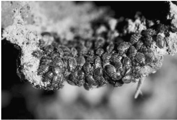
FIG. 1. Swallow bugs ( Oeciocacus vicarius ) clustering at the entrance of an unused cliff swallow nest, apparently in attempts to disperse on the legs or feet of a bird.

overwinter in cliff swallows' nests or in the cracks and crevices of the nesting substrate near the nests. Infestations can reach 2600 bugs per nest, and the bugs affect many aspects of cliff swallow life history (Brown and Brown 1986, 1992, 1996, Chapman and George 1991, Loye and Carroll 1991). Swallow bugs begin to reproduce as soon as they feed in the spring. Eggs are laid in several clutches that hatch over variable lengths of time, ranging from 3–5 days (Loye 1985) to 12–20 days (Myers 1928). Bug populations at an active colony site increase throughout the summer, reaching a peak at approximately the time nestling cliff swallows fledge. The bugs seem to be adapted to withstanding long periods of host absence, in some cases for up to three consecutive years (Smith and Eads 1978, Loye 1985, Loye and Carroll 1991, Rannala 1995). Bugs also parasitize introduced house sparrows ( Passer domesticus ) that occupy nests in some cliff swallow colonies (Hopla et al. 1993, Brown et al. 2001). Swallow bugs disperse between nests within a colony by crawling on the substrate and disperse between colony sites by clinging to the feet and legs of cliff swallows that move from one site to another (Brown and Brown 2004a).