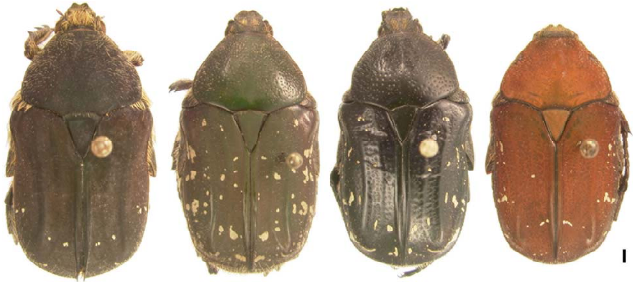
Figure 3. Euphoria steinheili . The first specimen represents the most common coloration seen in the material examined. Scale bar = 1mm.

Janson (1878) described Euphoria steinheili based on two specimens from Panama. In 1881, Janson described Euphoria punicea from specimens collected in the “Balzar Mountains” (probably Cordillera de Balzar, Province of Manabí) in northwest Ecuador.