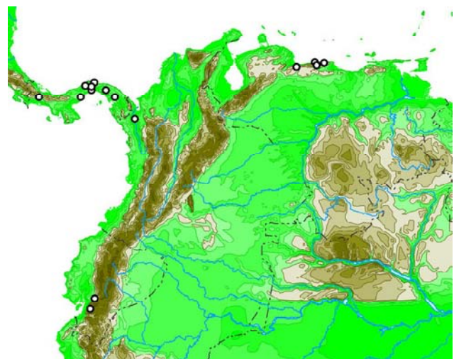
Figure 4. Distribution of Euphoria steinheili .

Specimens Examined: COLOMBIA: CHOCO: Parque Nacional Los Katios (1). ECUADOR: AZUAY: Huigra (3); IMBABURA: El Milagro (1), NO DATA: “Canon” (4), “Cordillera Oriental” (1), “Ecuador” (3). PANAMA: CHIRIQUI: Valle Hornito (6); COLON: Isla Barro Colorado (7), Lago Gatún near Limón (1), Parque Nacional Soberanía (7); DARIEN: Santa Fé (9); PANAMA: Cerro Campana (12), Lago Alajuela (1), Ipetí (2), Isla Majé