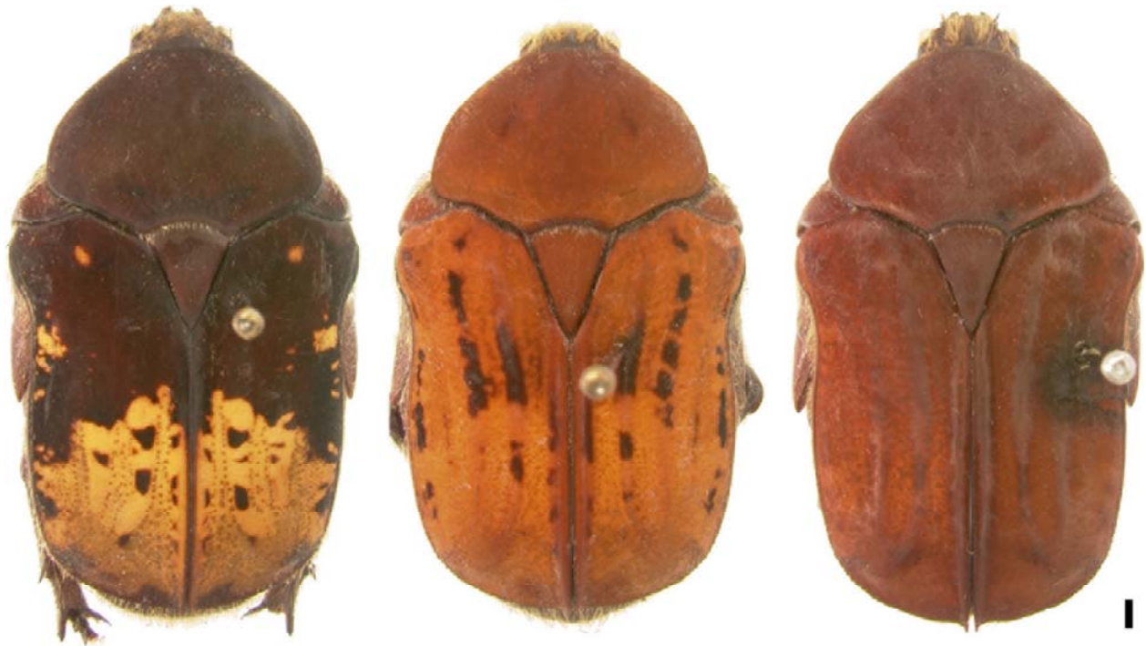
Figure 1. Euphoria hera . Scale bar = 1mm.

Phylogenetic data based on morphological evidence (Orozco 2007; Orozco and Philips, in prep.) show no support for Euphoriopsis as a valid genus. These data place Euphoria precaria Janson as the sister species of E. hera , within the Euphoria clade. Analysis of 37 specimens of E. hera from different museums confirmed the presence of a lateral marginal bead on the pronotum as suggested by Hardy (1988) and contrary to what Casey (1915) stated. The other character listed by Casey (1915), the presence of clypeal teeth, is not exclusive to E. hera , but is also present in E. annea Howden, E. areata (Fabricius), E. bispinis Bates, E. pilipennis (Kraatz), and E. verticalis (Horn).