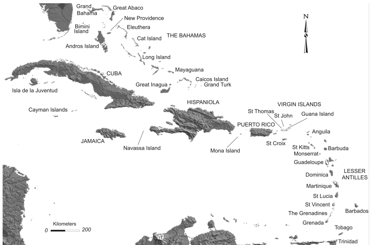
Figure 1. The West Indian Biodiversity Hotspot. The islands of the central and eastern West Indies and adjacent continental land masses, with the island arc of the Lesser Antilles in the east. The smaller islands of the Lesser Antilles are not indicated by name.

here used to fix a regression line for other larger and smaller islands of the Lesser Antilles relative to their areas. An average value was used for the slope of the regression line with z = 0.301 (McArthur and Wilson 1967). From this line a hypothesized species number can be obtained for each island.