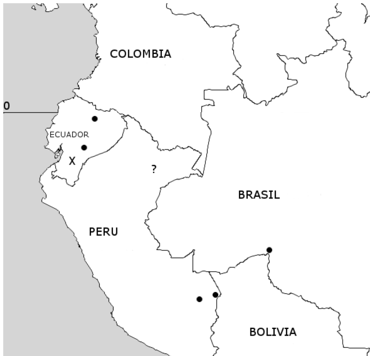
Figure 10. Distribution map for Megatharsis buckleyi Waterhouse. All known confirmed localities are indicated by black circles. The unconfirmed locality of Iquitos is marked by a question mark and the Andean localities presented by Blut (1939) around the city of Cuenca, are shown by a cross.

1000 m, and at least one specimen of M. buckleyi has certainly been collected in the environs of Macas at a similar altitude (P. Arnaud pers. comm.). One of us (CG) was fortunate to collect a single specimen of M. buckleyi whilst conducting fieldwork with students of the University of Manchester in the Payamino area of Orellana province in Ecuador during August 2008. The specimen was collected in a flight intercept trap (FIT) set in mature secondary Amazonian rainforest. Neither a large number of dung and carrion baited pitfall traps set in the area, nor the setting of two additional FITs nearby, yielded additional specimens during two weeks of sampling. The record is significant as it extends the known distribution of the species in Ecuador some 300 km northwards beyond the concentration of records from Morona-Santiago.