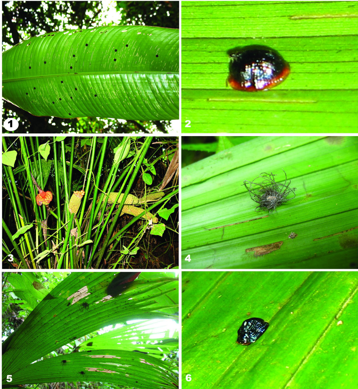
Figure. 1–6. Spaethiella with their hosts. 1) Spaethiella sp. 1 (Body length ca. 4mm), larvae and pupae on Heliconia latispatha . 2) Adult of Spaethiella sp. 1 with trenching feeding pattern. 3) Carludovica sp., host of Spaethiella sp. 2. 4) Spaethiella sp. 2, larva with bird's nest fecal case. 5) Spaethiella sp. 2, larvae and pupae, and window panes produced from trenching feeding pattern. 6) Spaethiella sp. 2, adult (Body length ca. 5mm).

curred in proximity, “window panes” were created (Fig. 5). Several larval cases were found with pupal exuviae inside. In two cases, tiny brown spiders were found to be sheltering next to the pupal exuviae.