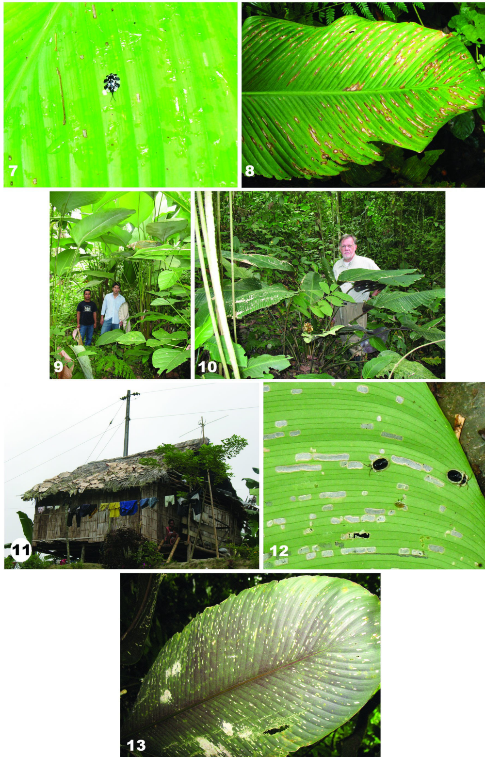
Figure 7–13. Aslamidium and their Marantaceae hosts in Ecuador. 7) Aslamidium capense adult (Body length ca. 6mm). 8) Feeding damage of A. capense . 9) EETP technicians R. Troya and J. Cedeño under a mature Calathea lutea . 10) Calathea majestica (with author R.W. Flowers). 11) Local house with roof made of Calathea and Carludovica leaves. 12) Aslamidium semicirculare adults (Body length ca. 5 mm) feeding on young C. lutea leaf. 13) Underside of leaf of C. majestica damaged by beetle chewing.