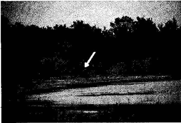
PLATE 1. Feral hogs "rooting" in basin marsh at Savannas Preserve State Park.

foraging by hogs. Water generally stands in the basins for only about 200 days per year, and they are associated with and often grade into wet prairies or marsh lakes (Florida Natural Areas Inventory 1990).