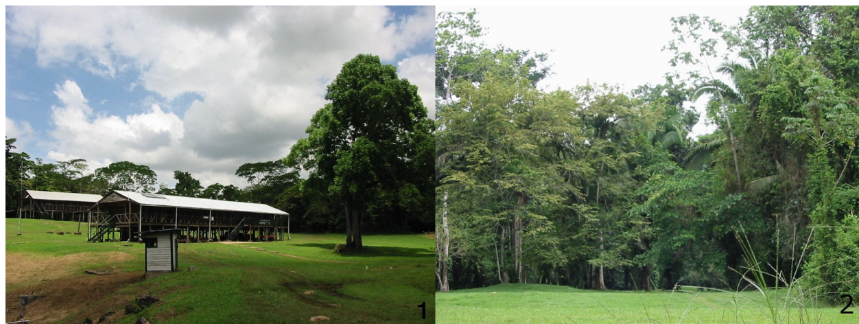
Figure 1-2. 1) Las Cuevas Research Station and surrounding rainforest vegetation, Cayo district, Belize, June 2006. 2) Rainforest vegetation at Pook's Hill, Cayo district, Belize, June 2006.

of the country. However, a comprehensive biodiversity inventory of the Dynastinae of Belize (and also Mexico and Guatemala) is currently in preparation (Ratcliffe and Cave 2008).