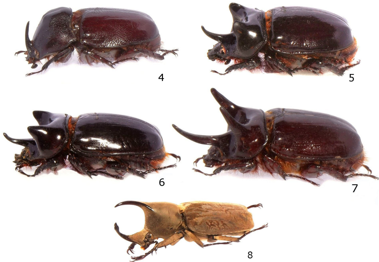
Figure 4-8. Dynastinae collected at Las Cuevas research station, Cayo, Belize, during June 2006. Male specimens illustrated. 4) Enema endymion . 5) Strategus aloeus . 6) Strategus longichomperus . 7) Strategus jugurtha . 8) Spodistes mnischei .