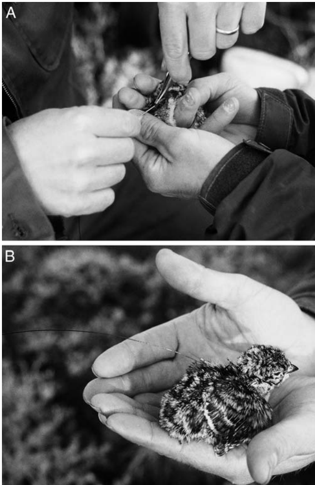
Figure 1. We implanted transmitters in greater sage-grouse chicks at capture locations at 3 study areas in Oregon and Nevada, USA, 2001–2002. (A) One individual held the chick and a second person trained in the method implanted the transmitter. (B) A 1-day-old greater sage-grouse chick after completion of the implant procedure.

death when radiomarked chicks disappeared with no evidence of radio failure and we assumed that a predator destroyed the chick and transmitter. We classified deaths as exposure when we found intact dead chicks near capture sites <1 day after marking, after brood females were depredated, or in conjunction with freezing temperatures and precipitation. We classified cause of death as unknown when we recovered intact chicks, excluded other mortality factors, and necropsy results did not provide a definitive diagnosis.