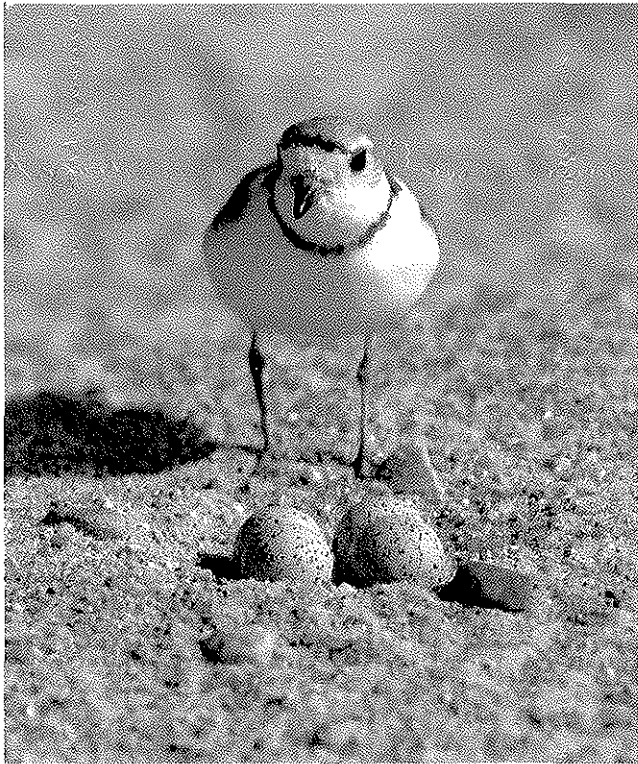
Fig. 1. Adult Piping Plover Charadrius melodus circumcinctus.

removing vegetation, spreading sand on the surface). Birds are not disturbed in any way during this process. If birds do nest in production areas, access to the area is restricted, as required by the Endangered Species Act. The TPCP monitors the area and, when the birds have finished nesting and left, opens the area back up to mine production. The net effect is an economic win-win situation. The mining companies and the birds are both able to continue production and maintain their revenue streams (sand and gravel for the miners and chicks for the birds) without conflict. By allowing continued production of waste sand piles at the mines, additional nesting habitat is created for the birds. The same method has