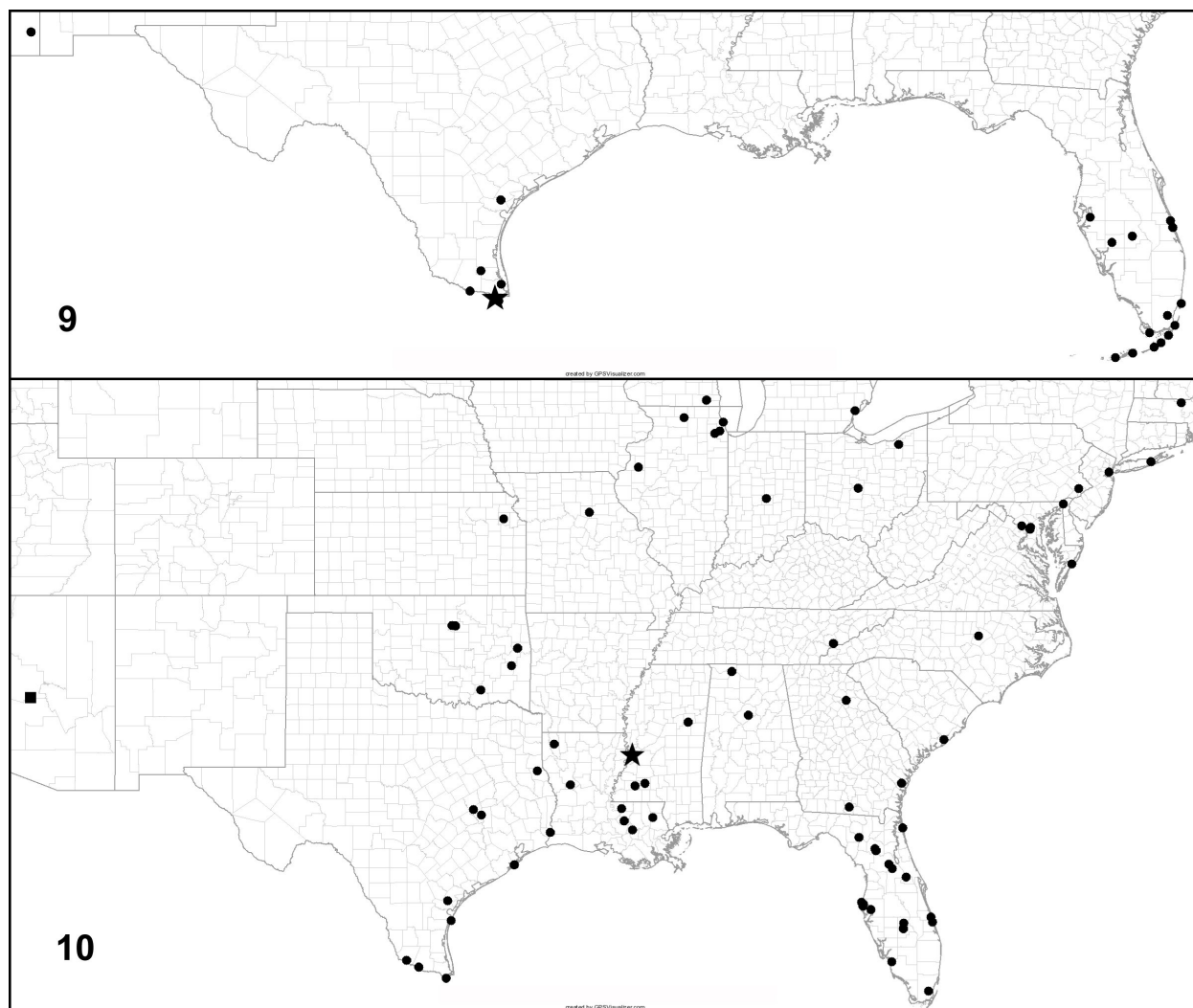
Figures 9-10. Distribution of Xanthocomus spp. in North America (star = type locality; square = state record only). 9) X. rutilans . 10) X. concinnus .

2009, UV light, palm forest, E.G. Riley-1037 (1, TAMU); Laguna Atascosa NWR (site 1), 26.22375°N, 97.35454°W, 25 Mar 2009, dense coastal brush, beating, J. King & E. Riley-594 (1, TAMU); vicinity Southmost School, 01 May 1979, C.L. Smith (1, UGCA); Brownsville, 01 Jun 1904, H. Barber (1, USNM); same but 08 Jun 1934, J.N. Knull (1, OSUC); same but 08 May 1935 (1, OSUC); same but 07 Apr 1950, D.J. & J.N. Knull (1, OSUC); same but 04 Jul 1939, J. Russel (1, SEMC); same but 04 Mar 1936, on cotton roots in soil, P.A. Glick (1, TAMU); same but 06 March 1936 (1, TAMU); Hidalgo Co.: Santa Ana National Wildlife Refuge, Willow Lake, 13 m, 26°04[.]832'N, 98°08[.]458'W, 07 Feb 2005, C.L. & S.L. Staines (1, USNM); same except Jaguarundi Trail, 23 m, 26°03[.]727'N, 98°08[.]458'W, 09 Feb 2005, C.L. & S.L. Staines (6, USNM); Santa Ana National Wildlife Refuge, 25 m, 26°05[.]041'N, 98°08[.]194'W, 22 Jan 2005, blacklight, C.L. & S.L. Staines (1, USNM); Lower Rio Grande Valley NWR, La Coma (site 2), 26.05611°N, 98.03635°W, 09 Apr 2009, re-vegetated site, beating, J. King & E. Riley-697 (1, TAMU); same except 23 Apr 2009 and J. King & E. Riley-806 (2, TAMU); San Patricio Co.: Welder Wildlife Refuge, 27 Sep 1976, blacklight trap, R. Turnbow (1, FSCA); Willacy Co.: Lower Rio Grande National Wildlife Refuge, East Lake Tract, 22 m, 2[6]°31[.]462'N, 97°52[.]291'W, 25 Jan 2005, C.L. & S.L. Staines (2, USNM).