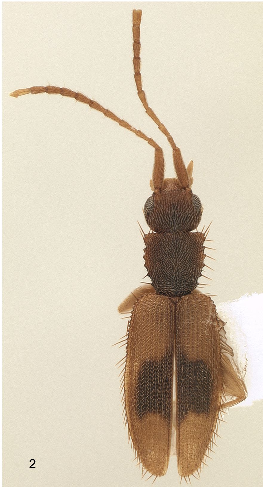
Figure 2. Telephanus bellus Thomas, n. sp., habitus.