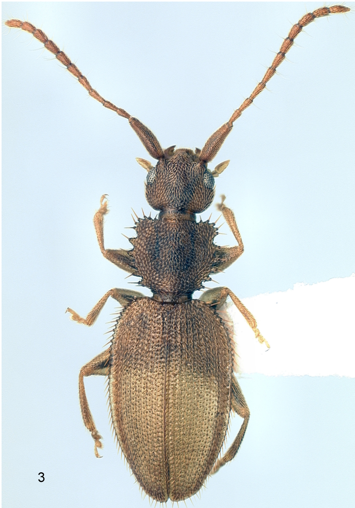
Figure 3. Telephanus monstrosus Thomas, n. sp., habitus.