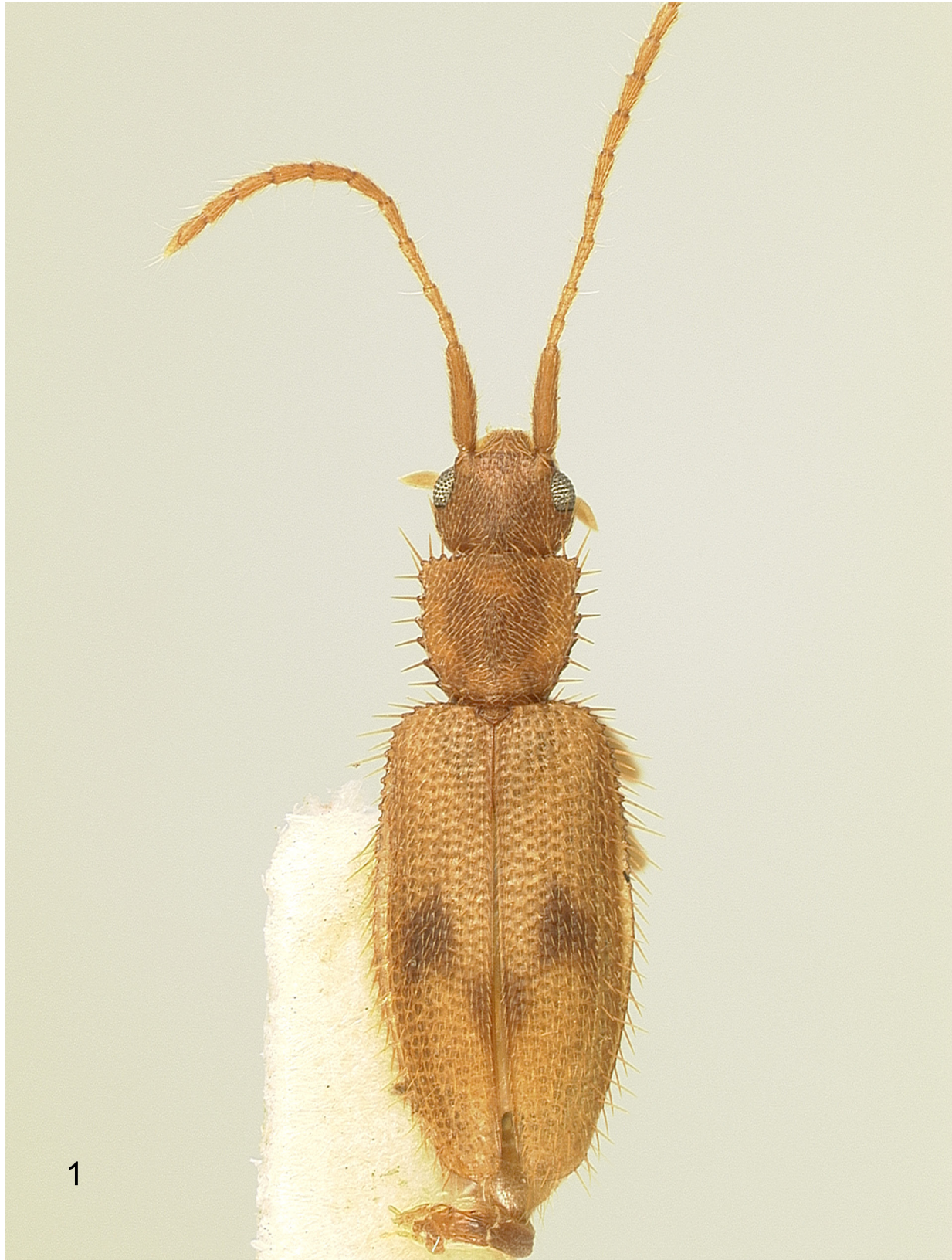
Figure 1. Telephanus serratus Nevermann, habitus.