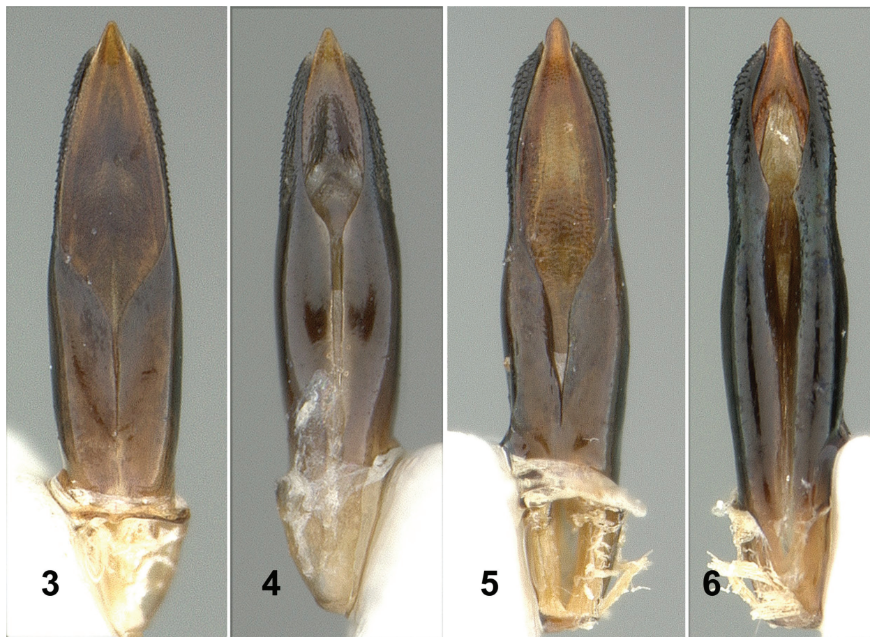
Figures 3–6. Male genitalia of Chrysobothris species. 3) C. thoracica from Guánica, Puerto Rico, dorsal view. 4) Same specimen, ventral view. 5) C. guadeloupensis from Gourbeyre, Guadeloupe, dorsal view. 6) Same specimen, ventral view.

18°00.663'N, 67°01.185'W, 8 meters, A. S. Konstantinov (NEWC). BRITISH VIRGIN ISLANDS: 2 females, Guana Island, 0-80 meters, 1-14 July 1984, S. E. & P. M. Miller (USNM); 1 female, same data but 5-23 July 1985 (USNM); 1 male, same data but 20-24 July 1985 (USNM); 1 male same data but 9-23 July 1987 (USNM). U. S. VIRGIN ISLANDS: 1 male, St. Croix, Frederiksted, Lagoon Street, 25 January 1977, J. Yntema, in office (USNM).