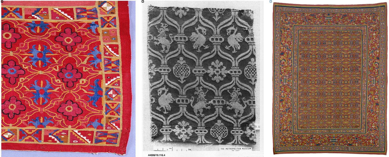
Figure 7, left. Detail, MMA mantle as shown in figure 2.

themselves take shape—sometimes in the guise of a crown or jewel. It was also found in painted leather wall panels, a type of furnishing material that was well known in Spain, and may have been brought to the new world, as well. (Figure 9.) This motif was incorporated in the Andes, into some Colonial era tapestry examples, woven by highly skilled former Inca weavers, with incredible attention to detail.