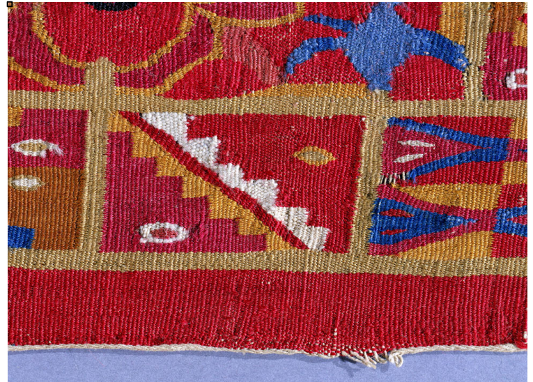
Figure 13, right. 13 MMA mantle, (fig.2) detail of edge design with Inca-style warp looped selvedge.

We can see that while the traditional Andean weaving methods persisted well into the Colonial era--such as in the unique technical treatments of warps and wefts. (Figure 13.) Whole new layers of interpretation need to be engaged, resulting in a more complex and nuanced understanding of material culture produced in the age of global trade and cultural interchange. As ideas are represented in the textiles that were produced during this vital period of Andean cultural development and change, their meanings and contexts still require further interpretation.