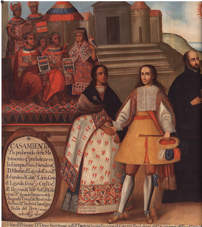
Figure 12, left. Detail, Marriage of Martin de Loyola to Dona Beatriz Nusta. Late 17 th c. Oil on canvas. Convent of Copacabana, Lima.

presented in rows. Nor do we see it in Colonial examples. So the unique qualities of the mantle lay both in its design and context.