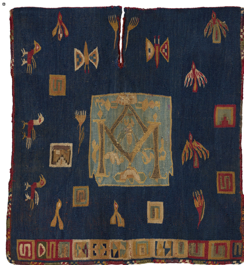
Figure 4. Miniature Tunic for Statue of Christ, Uncu Santo (side A). Museo Etnografico y Folklore, La Paz, Bolivia.

details of these Inca garments through dressed ritual figurines preserved in high altitude ceremonial site burials. 5 Women of high rank and special privilege wore matching sets of garments, though preserved examples are fewer, but show the use of special designs. While some have argued that they are not the same tocapu designs, others, like myself, have proposed that they, in fact, reflect the origin of the tocapu . 6