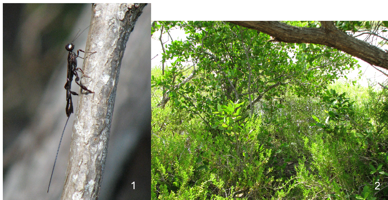
Figures 1-2. Megischus brunneus . 1) Female resting on a mangrove trunk of Laguncularia racemosa at Oviedo Lake, Pedernales. 2) Habitat at Oviedo Lake constituted by salt marsh vegetation and mangroves

Johnson 2003). The distributional records (Fig. 3) show that M. brunneus is present in dry areas of the southwestern Dominican Republic.