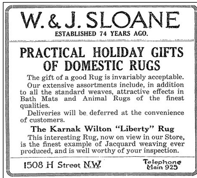
Figure 5. W. & J. Sloane advertisement, Washington Post, December 10, 1917.

While the Liberty Rug was produced by Shuttleworth Bros., its market distribution was controlled by the New York-based merchandiser W. & J. Sloane. Sloane had their own showrooms but – based on what appear to be descriptions of the same rug being sold at stores throughout the United States – they also sold wholesale to other retailers. In their own advertisement in The Washington Post on December 10, 1917, Sloane referred to the Liberty Rug as the “finest example of Jacquard weaving ever produced” (Figure 5). Other sellers’ advertisements for the rug used adjectives such “interesting,” “original,” and “magnificent,” extolling it as a “novel design,” “one of the late triumphs of the rugmakers,” and a representation of the “best efforts of American designers.” 33