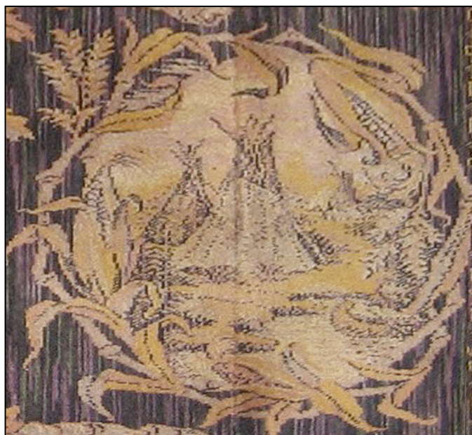
Figure 4. Liberty Rug, detail. Woodrow Wilson House, Washington, DC. 61.16.100.

The juxtaposition of historical elements and contemporary life represents an appreciation of the past tempered by the Progressive-era drive to move forward. From galleons and wagons to airplanes and trains, from Wild West to big city, from farm to industry, the rug provides a series of sharp contrasts between life “then” and “now.” Additionally, many of the rug’s motifs address transportation not only as a symbol of progress and modernity, but as a unifying force, bringing together people and places across the nation, a powerful message in an international period of war and division. Historic sites, such as Mount Vernon and Lincoln’s cabin make connections with two vital American figures from wars past, legitimizing by association America’s role in the present war, while tying it neatly into the narrative of national progress.