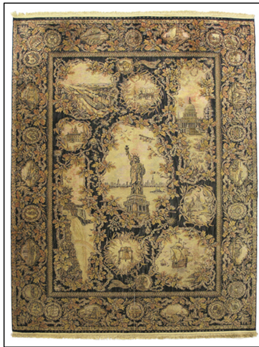
Figure 1: Liberty Rug. Manufactured by Shuttleworth Brothers, Amsterdam, New York, for W. & J. Sloane, c. 1917. Karnak Wilton rug; worsted wool, linen. 12' x 9'. Woodrow Wilson House, Washington, DC. Bequest of Edith Bolling Wilson to the National Trust for Historic Preservation. 61.16.100.

On December 2, 1916, against the bustling background of the New York harbor, President Woodrow Wilson officiated the floodlighting of the Statue of Liberty, the nation’s treasured gift from France thirty years prior. From his viewpoint on the naval yacht Mayflower , the President witnessed a military salute by ships from the Atlantic fleet and the overhead circling of aviatrix Ruth Law, whose plane’s fuselage lit up with the word “LIBERTY” while boats in the harbor tooted their horns against a backdrop of shooting flares. The star-spangled spectacle elicited gasps, cheers, and applause from the awe-struck crowd, and papers across the country covered the event, fueling war-time patriotism and a sense of American industrial triumph. 1