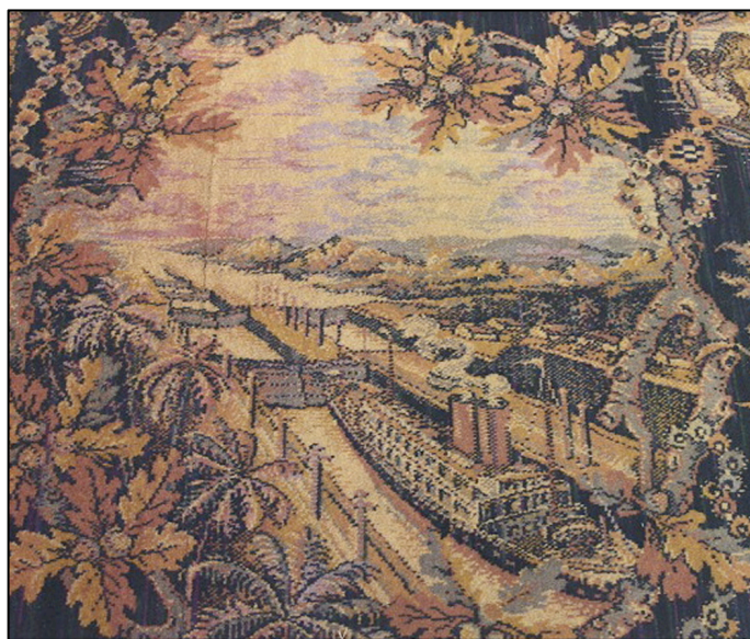
Figure 3. Liberty Rug, detail. Woodrow Wilson House, Washington, DC. 61.16.100.

modern times”; a buffalo; and finally, a “Prairie Schooner” – the Conestoga wagon that carried settlers across the west. 18 Among the “typical scenes” of progress past and present are “cotton on the wharves [in New Orleans], the industries of Pittsburgh; the oil wells of Oklahoma; the wheat fields of the West; the coal mines of Pennsylvania, transportation on the Mississippi River; California with its mamouth [sic] trees” and “George Washington’s famous Mt. Vernon mansion on the banks of the Potomac and... the little log cabin in which Lincoln was born.” 19 Three framing devices surround the rug’s motifs: silvery branches of oak leaves and acorns (the national tree), ears of corn in their husks (a symbol of American agriculture), and fronds of goldenrod (the national flower). 20