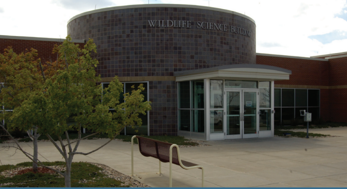
NWRC headquarters in Fort Collins, CO.

NWRC is a leader in providing science-based solutions to the complex issues of wildlife damage management as related to agriculture, property, human health and safety, invasive species, and threatened and endangered species. NWRC scientists strive to find solutions that are biologically sound, environmentally safe, and socially acceptable for use in resolving wildlife damage-management problems throughout the United States and abroad. Often, the WS program’s operational personnel assist NWRC scientists in developing and evaluating new management tools and methods.