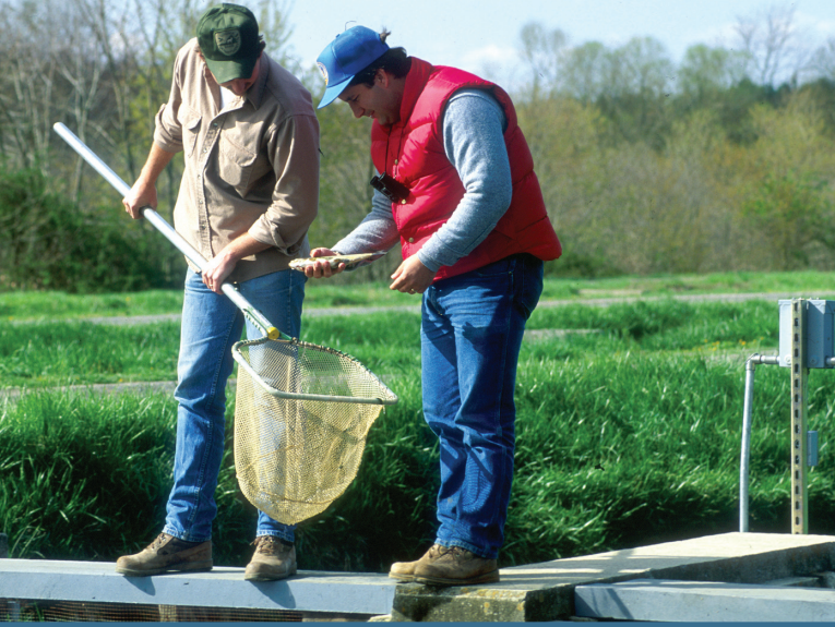
Evaluating cormorant damage at fish farms.

Once benefits are identified, a monetary value must be assigned. This is the most difficult and sophisticated part of the BCA and is where economists play an important role. Some resources that are bought and sold regularly (e.g., market goods such as cattle or corn) are easily assigned a value. It’s more difficult to determine the value of a wild antelope or an endangered Puerto Rican parrot, a decrease in the spread of a disease, or enhanced wildlife viewing opportunities. When markets do not exist, valuation must be estimated using nonmarket techniques.