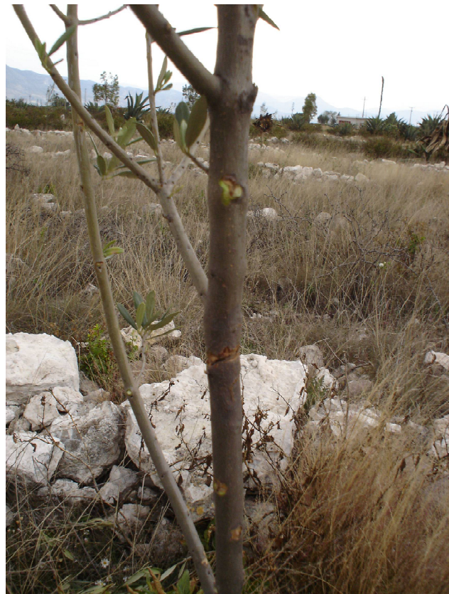
Figure 3. Olea europaea L. with incipient breeding attacks of Hylesinus mexicanus .

In 2008 specimens were brought to us by Edgar Pioquinto Nandho who reported that they were feeding on shoots of olive, Olea europaea L. (Oleaceae). According to the collector attacks were more prevalent on young trees under drought stress. In areas where the trees are irrigated damage was absent. In some cases the insects bored into the tips of shoots, which later flagged and dropped off. When breeding occurs, adults make