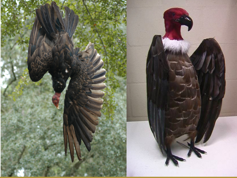
Taxidermied (left) and artificial vulture effigies are used to disperse vultures from their roosts.

Research conducted by NWRC scientists has demonstrated that proper installation of a vulture effigy almost always causes abandonment of the roost within 3 to 5 days. The effigy is either a taxidermic mount of a vulture or a commercially available artificial likeness.