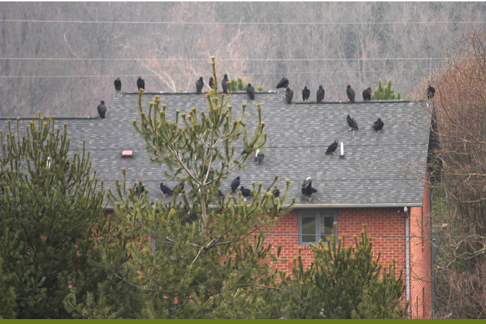
NWRC scientists are investigating nonlethal methods for preventing vulture damage to houses and other structures.

To gain a better understanding of vulture impacts on livestock, NWRC scientists are conducting research to (1) develop a population model for black vultures that can be used to evaluate potential management options, and (2) analyze vulture movement patterns and roosting activity using geographic information system (GIS) techniques.