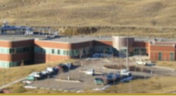
The National Wildlife Research Center in Ft. Collins, CO.