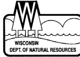
Wisconsin Department of Natural Resources