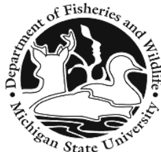
Michigan State University, Department of Fisheries and Wildlife