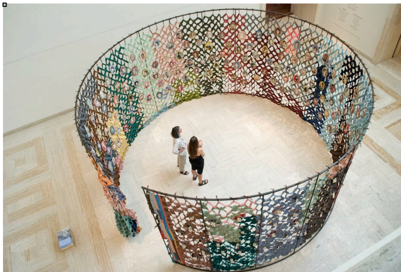
Figure 3: Forget-me-not: Mothers and Sons .

Catastrophe , of 2006, is the most overtly political work of this group, and marks the emergence of figurative imagery in Watt's work. Catastrophe was inspired by the infamous Figures of Iraqi prisoners abused by U.S. soldiers at Abu Ghraib. 15 The piece recalls, in the forms of the figures, its subject matter of war and torture, and its disturbing imagery, the similarly monumental paintings of American painter Leon Golub. Watt stated that the piece was "about the human impulse to console a victim after a disaster. I made a blanket for the victims, to give them shelter, to shield them, and in my own way to offer comfort or consolation." 16