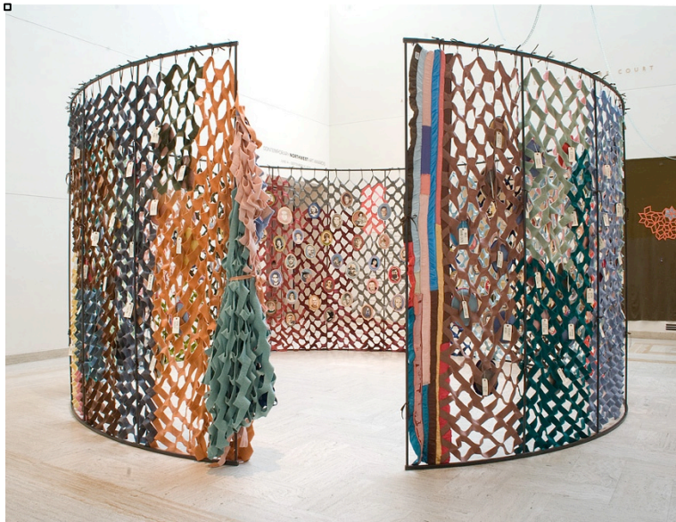
Figure 1: Marie Watt, Forget-me-not: Mothers and Sons (2008), 120 in. high x 240 in. diameter, installation view, Portland Art Museum, collection of the artist.

Watt’s 2008 work Forget-me-not: Mothers and Sons is an installation piece memorializing soldiers killed in the Iraq and Afghanistan wars. Wishing to humanize the stories of soldiers from the Pacific Northwest, many of them very young, who had lost their lives, Watt created a series of memorial portraits, hand-stitched using wool blankets. In the installation, the portraits hang from a web also made from wool blankets that surrounds and envelopes the viewer. An accompanying piece titled Forget-me-not: Blossom , comprised of hundreds of handmade wool flowers and a large basalt stone, commemorates the civilian lives lost in the wars.