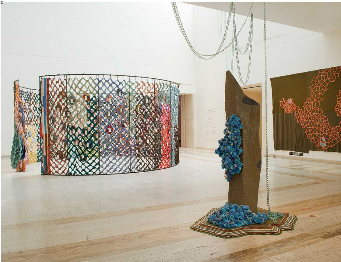
Figure 6: Marie Watt, Forget-me-not: Blossom (foreground) with Forget-me-not: Mothers and Sons and Compass (2008), installation view, Portland Art Museum, collection of the artist. Image courtesy Marie Watt.

Accompanying and balancing Forget-me-not: Mothers and Sons , with its intricately stitched portraits, is a more abstract memorial piece titled Forget-me-not: Blossom , comprised of hundreds of handmade wool flowers in shades of blue, purple, green, and pink, representing civilians killed in the wars, and a large basalt stone suggesting a memorial stele. The flowers, meant to resemble forget-me-nots, were made by community members in blossom-making events, in acts of individual remembrance that combined to create a larger community memorial or tribute.