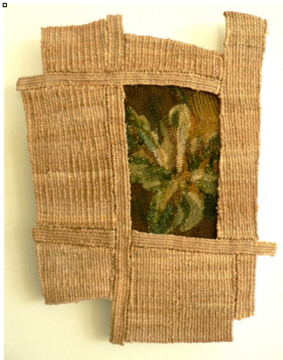
Figure 12. Dorothy Clews, "Antipodean Landscape" 9"H x 6.75"W

Raffia, retaining its characteristic dryness and slightly irregular quality, is reminiscent of the harsh arid landscape of Southwest Queensland where Clews lived. She says 'a weaver has to tune herself to the varied characteristics of each length; much like a gardener has to react to the environment and climate when gardening. There is a need to make adjustments as the work progresses'. Incorporating the fragments created a need to let the materials inform the process and the end result, letting go of preconceived ideas.