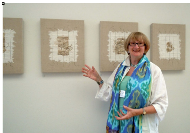
Figure 8. Linda Wallace "Infertility series: Diminishment of Hope." Installation view – six panels, each one measures 22" high x 16" wide.

The sense of freedom she felt, as she moved beyond traditional rules, was compounded by unexpected joy as she slowly transformed a jumbled mess of rotted textile into an object of beauty. She discovered a newfound ability allowing her to transform the voice she uses, to communicate with the viewer. While maintaining a connection, she could now move from her earlier tapestries: woven line by line, gradually creating a preconceived image. No longer dependant on the use of intriguing imagery and luscious colour, she could use quiet beauty and a more gentle voice. Without the image, she needed to explore the possibilities of allowing the actual materials and the process to convey the conceptual content of the work. The search for the subtle tools needed to do that was a challenge. But, it was a challenge where playfulness could become a valuable component of the research.