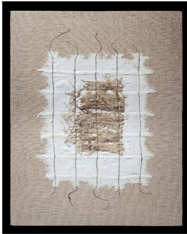
Figure 10. Linda Wallace “Implantation Series. Diminishment of Hope: NonGravid 22 July” panel 5 of 6. Panel dimensions: 22’H x 16”W.

couching thread and the strand being stitched often dictated the final placement. The process became strangely collaborative.