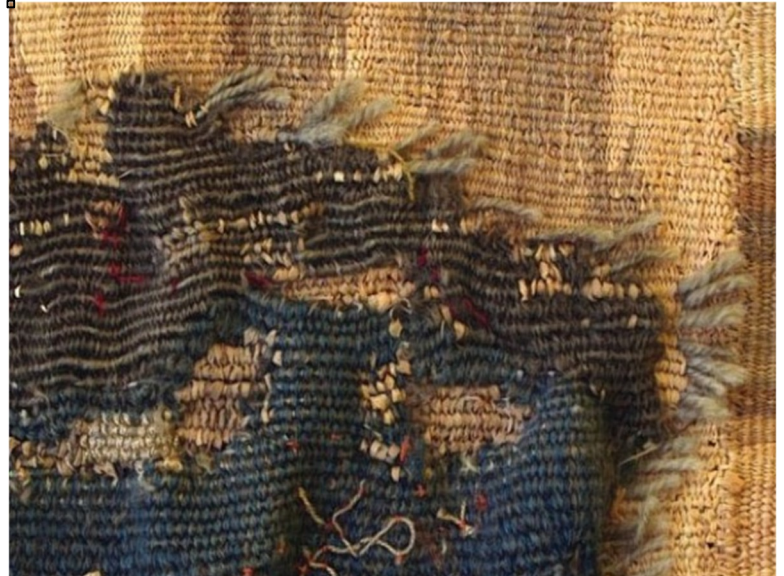
Figure 14, left. Dorothy Clews. "The Space Between" Raffia and antique tapestry fragment both stitched and woven into raffia backing.