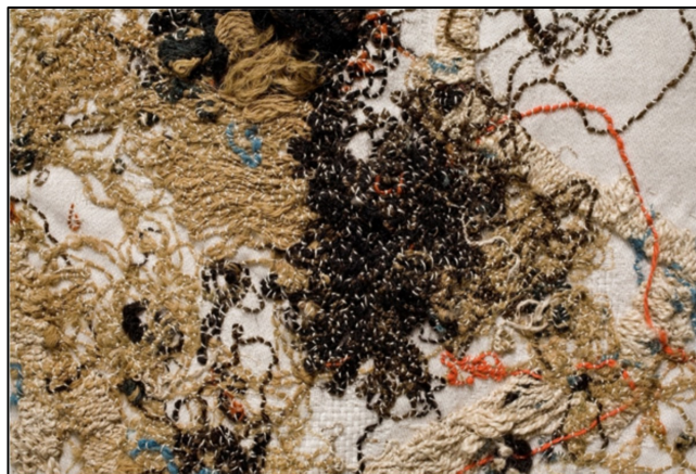
Figure 4. Linda Wallace. "Repatriation" 25" H x 22" W (detail)

Fifty tapestries were created and sent, but often their ongoing conversations and developing friendships had equal importance for the participants. The resulting exhibition travelled to nine Australian and five Canadian galleries and became the inaugural online exhibition at the American Tapestry Alliance website. 1 It was also covered in a four-page article, in American Style magazine. 2 Neither Wallace nor Clews had experience as curators on this scale, nor had either of them managed an international, multi-person project. From positions completely 'on the edges', they pulled it off.