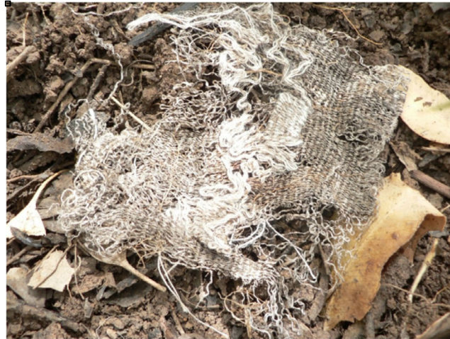
Figure 5. Dorothy Clews "Third Seed" (decomposed tapestry in planting site)

act of repair and conservation; they would continue to explore their dual concepts of human infertility and fertility of the landscape. 1