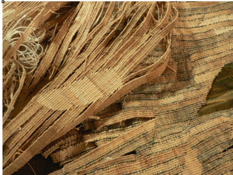
Figure 13. Dorothy Clews. Untitled work in progress. Raffia and antique tapestry fragments. Tapestry and hand stitching.

"Tapestry is not commonly seen in Australia outside of the southern state capital cities. In the outback society, creative solutions are more likely to be concerned with dealing with the inability to access things easily and with the more practical aspects of life on the land. Rather than spending time hand-stitching and weaving, any textile work is more likely to be a no fuss combination of utility and hobby."