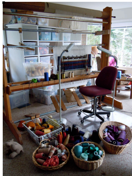
Figure 6. Linda Wallace's studio with tapestry in progress. Vancouver Island, Canada

Undermining the apparent initial loss of value, the hours of time devoted to the actions of preservation, cleansing and stitching, cause the conserved fragments to be re-valued. The ragged fragments: composted, reclaimed, conserved and stitched, question how preciousness is defined. Wallace and Clews also project in their work the joint concept that all tapestry, as in all life, is ephemeral.