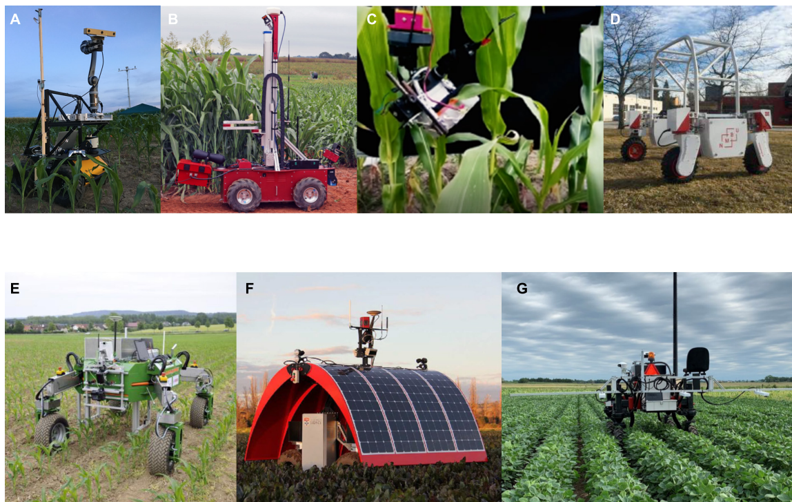
FIGURE 3 | Plant phenotyping systems for outdoor environment: (A) Vinobot: robotic system including six DOF robotic manipulator and a 3D imaging sensor mounting on a mobile platform to measure plant height and LAI (Shafiekhani et al., 2017), (B) Robotanist: UGV-based robotic system equipped with a three DOF robotic manipulator and a force gauge for stalk strength measurement (Mueller-Sim et al., 2017), (C) A robotic system to slide LeafSpec across entire leaf to collect its hyperspectral images (Chen et al., 2021), (D) Thorvald II: VIS/NIR multispectral camera mounted on a mobile robot to measure NDVI (Grimstad and From, 2017), (E) BoniRob: autonomous robot platform using spectral imaging and 3D TOF cameras to measure plant height, stem thickness, biomass, and spectral reflection (Biber et al., 2012), (F) Ladybird: ground-based system consisted of a hyperspectral camera, a stereo camera, a thermal camera, and LIDAR to measure crop height, crop closure, and NDVI (Underwood et al., 2017), and (G) Flex-Ro: high-throughput plant phenotyping system equipped with a passive fiber optic, a RGB camera, an ultrasonic distance sensor, and an infrared radiometer for the measurement of NDVI, canopy coverage, and canopy height (Murman, 2019).

thus crop yield improvement. Accordingly, there has been an emerging need for phenotyping robots to automatically measure the phenotypic traits. Regarding the plant structure, maize, and sorghum have similar morphology. Their leaves are arranged alternately on each side of the stem that has cylindrical/elliptic-cylinder shape and is positioned in the middle part of the plant. This plant structure provides less complexity for the robotic system to distinguish between the stem and leaves and extract their features. Figure 4B shows that the height, width, and volume of plant/canopy are three main (morphological) traits that more frequently measured by the robotic systems than other traits, each of them being \leq 5\% (leaf length, leaf width, leaf angle, leaf area, leaf reflectance, leaf chlorophyll content, leaf/canopy temperature, LAI, plant/canopy NDVI, stem reflectance, stalk strength, stalk count, berry size, and fruit count). Two reasons can be considered for the frequent measurements of these phenotypic traits. Firstly, the plant architectural traits (such as plant height) are the most common and important parameters for field plant phenotyping since they have significant effects on light interception for photosynthesis, nitrogen availability, and yield (Barbieri et al., 2000; Andrade et al., 2002; Tsubo and Walker, 2002). Consequently, by studying and then manipulation of the plant architecture, the crop productivity will be increased.