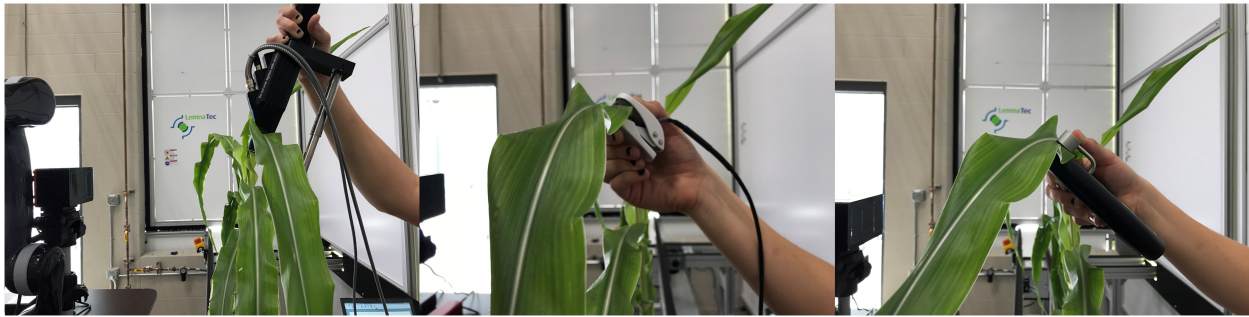
FIGURE 2 | Manual measurements of leaf reflectance ( left ), leaf temperature ( middle ), and chlorophyll content ( right ) (Atefi et al., 2019).

(Vinobot) including a six DOF robotic arm with a 3D imaging sensor mounted on a mobile platform. The Vinobot collected data in order to measure plant height and leaf area index (LAI) of maize and sorghum ( Figure 3A ). The authors reported that the use of a semi-autonomous approach created most of challenges for navigation of the system. In this approach, the alignment of the robot with the crop rows was required before autonomously moving between the rows and collecting data from the plants.