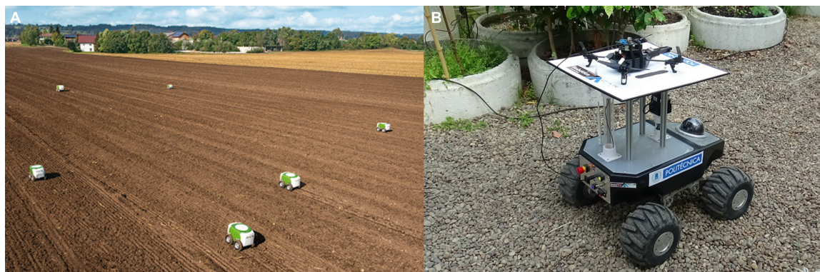
FIGURE 5 | (A) Mobile Agricultural Robot Swarms (MARS) for seeding process (The European Coordination Mobile Agricultural Robot Swarms (MARS). PDF file. November 11, 2016. http://echord.eu/public/wp-content/uploads/2018/01/Final-Report-MARS.pdf ), (B) UAV-UGV cooperative system to measure environmental variables in greenhouse (Roldán et al., 2016).